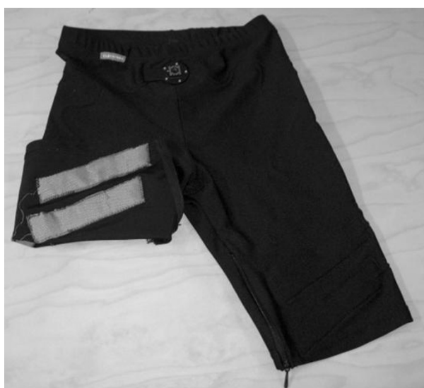
Figure 3 EMG shorts used to collect muscle EMG activity from thigh muscles.

measures and ~100 derived variables with clear biochemical interpretation and significance. The directly measured metabolites include lipoprotein subclass distribution with 14 subclasses quantified including particle concentrations and individual subclass lipids, low-molecular-weight metabolites such as amino acids, ketone bodies, and creatinine, and detailed molecular information on serum lipid extracts including free and esterified cholesterol, sphingomyelin, degree of saturation and \omega -3 fatty acids. Derived variables include selected ratios of metabolites implicated in lipolysis, proteolysis, ketogenesis and glycolysis as well as reagents and products of enzymatic reactions and measures obtained with the extended-Friedewald formula, eg. apolipoprotein A-I and B [45]. Further details of the NMR spectroscopy, quantification data analyses, as well as the full metabolite identifications can be found from [46,47].