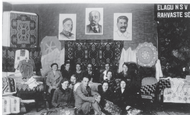
Photo 2. Women’s handicraft exhibition in a Valga community house, with leaders and a banner saluting the “Friendship of the Nations” on the wall, 1940.

In Soviet grass-roots-level cultural work, persistent checks, reports, fixed repertoire in music, theatre plays and other amateur arts became an inevitable part of everyday life from the first days of the new regime. The legislative basis for Soviet censorship was the Decree on the Printed Word, adopted on October 27, 1917 by the Council of Peoples’ Commissars, and it was in force until 1990. The role of censorship (pre-, post- and permanent censorship) was broad – all artistic creations (literature, music, art, newspapers, TV and radio programs, as well as amateur art practices in community houses) were subject to it. As Veskimägi (1996, 327) notes, “not a single printing office accepted any manuscript without the imprimatur of the censor. The Soviet censorship system was duplicated and performed by many authorities – by the central committee of the CP of the republics, the KGB, the Council of Ministers and Glavlit [The USSR Chief Office of Literature and Publishing Affairs].” 83