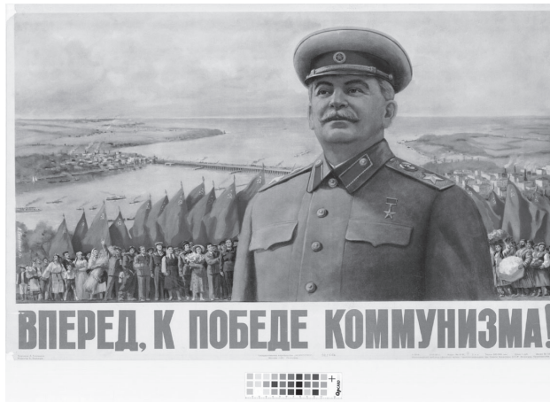
Poster 2. Expression of “national diversity” and “ultimate unity”. Estonian History Museum, Collection of Posters (F158-1-23).

As Slezkine (1994, 418) explains it, Lenin’s socialists needed native languages, native subjects and teachers (“even for a single Georgian child”) in order to “polemicize with ‘their own’ bourgeoisie, to spread anticlerical and antibourgeois ideas among peasantry and burghers” and to “banish the virus of bourgeois nationalism from their proletarian disciples and their own minds”. Mertelsmann (2012, 12) points out that the Soviet nationalities policy, based on the concept of korenizatsiia (“taking root”), to build up and secure the central power the Soviet system needed the help of national cadres. The basic concepts for national and cultural policies were worked out by Lenin and developed by Stalin. The Soviet concept of “national diversity” and “ultimate unity of nations” under the red flag and leadership of Stalin, has been visualized on poster 2: