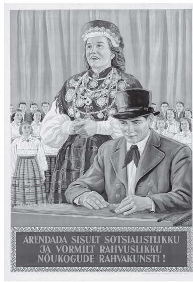
Poster 3. “To Develop Soviet Folklore: Nationalist in Form and Socialist in Content!” Estonian History Museum, Collection of Posters (F158-1-7).

A specific feature of Soviet cultural policy was its highly bureaucratic nature. As all cultural organizations were state funded, they were also guided and controlled