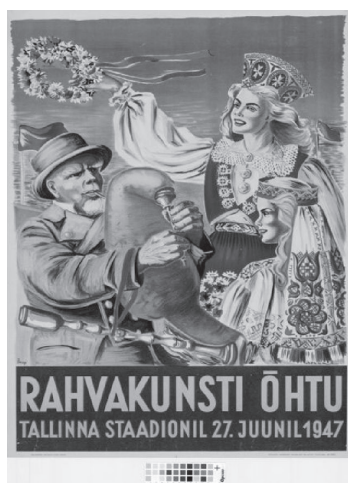
Poster 1. Evening of Folklore Art in Tallinn 1947. Estonian History Museum, Collection of Posters (F158-1-36).

The government sponsored village expeditions to gather folkloric materials, folk singing competitions, and festivals of national art featuring works produced by various Soviet nationalities. The government established the N. Krupskaya All-Union House of Folk Art in Moscow, as well as institutes of national culture all over the country. 33 Folk culture was used by party leaders to promote controlled and artificial representation of Soviet forms of national cultures. An example of political representation of Estonian folklore, see poster 1 from 1947: