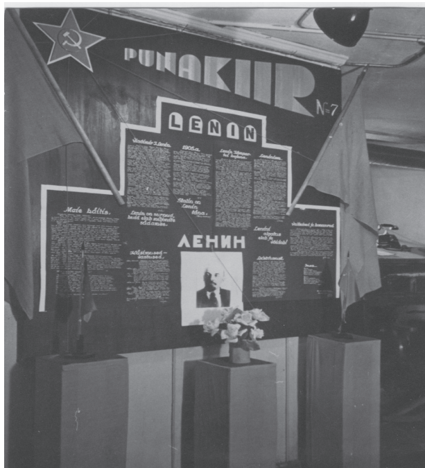
Photo 1. Wallboard “Red Ray” 1941 (Seinaliht “Punakiir”) to celebrate Lenin’s death anniversary in 1941. Estonian History Museum (AM 1480/R F 2569).

How was the situation perceived by people from community organizations, who had up until August 1940 operated on free citizen initiatives, upon their reading of the new rhetoric and guidelines? Per Wiselgrad (1942, 105) has described that many people perceived the hypocritical rhetoric of the new regime as mental oppression. The constitution solemnly promised freedom of the press, speech, association and personal security; in reality none of it was true: