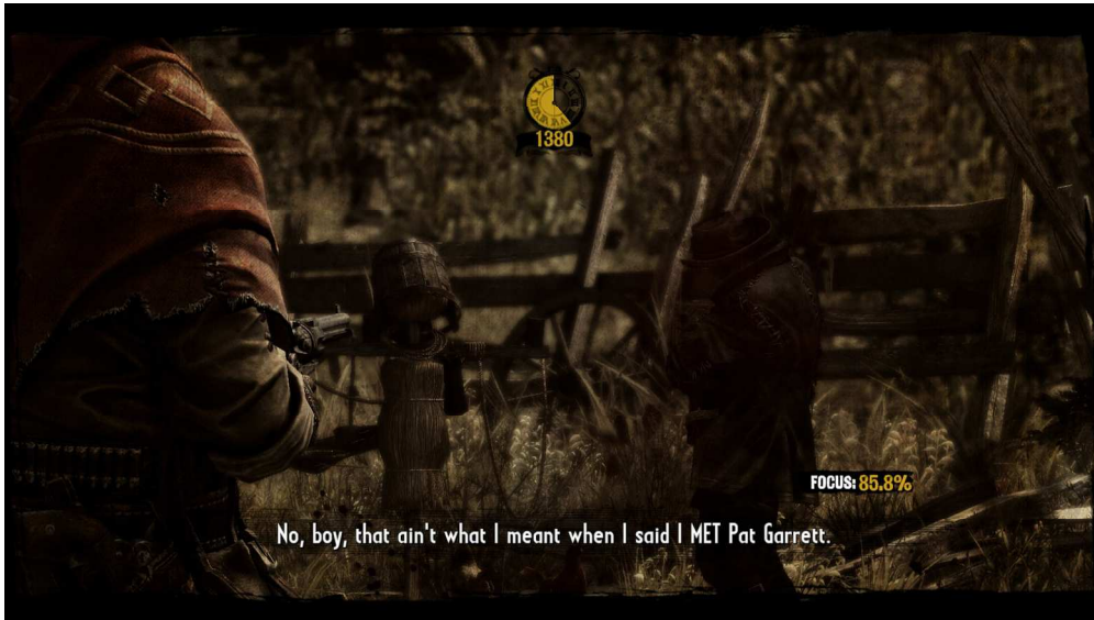
Winning a duel that never happened in Call of Juarez: Gunslinger (Techland, 2013) 677x381mm (72 x 72 DPI)

1 2 3 4 5 6 7 8 9 10 11 12 13 14 15 16 17 18 19 20 21 22 23 24 25 26 27 28 29 30 31 32 33 34 35 36 37 38 39 40 41 42 43 44 45 46 47 48 49 50 51 52 53 54 55 56 57 58 59 60