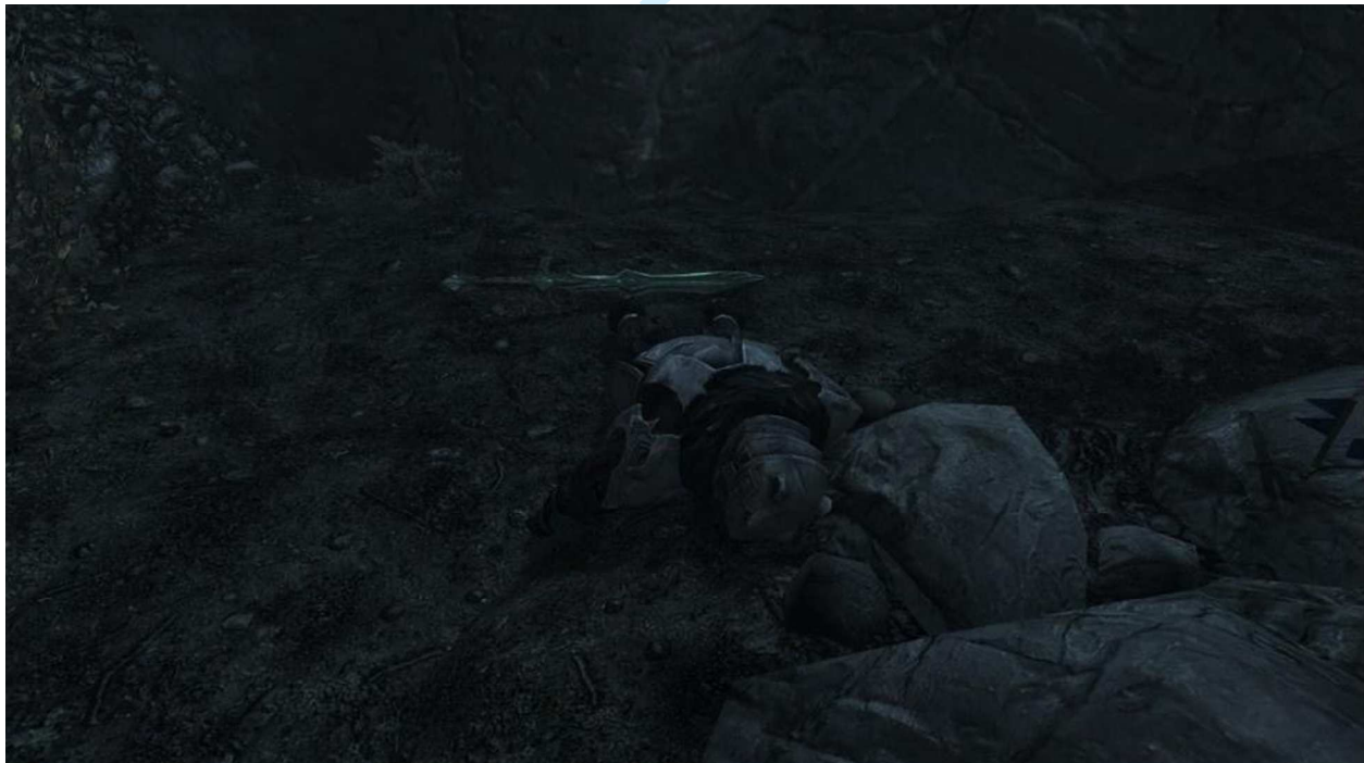
54 55 56 57 58 59 60 Figure 3 The mighty Dragonborn, dead from falling down a cliff in The Elder Scrolls V: Skyrim (Bethesda Game Studios, 2011)