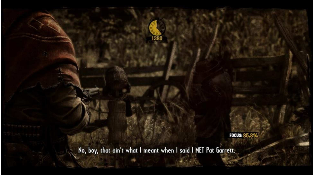
Figure 4 Winning a duel that never happened in Call of Juarez: Gunslinger (Techland, 2013)

1 2 3 4 5 6 7 8 9 10 11 12 13 14 15 16 17 18 19 20 21 22 23 24 25 26 27 28 29 30 31 32 33 34 35 36 37 38 39 40 41 42 43 44 45 46 47 48 49 50 51 52 53 54 55 56 57 58 59 60