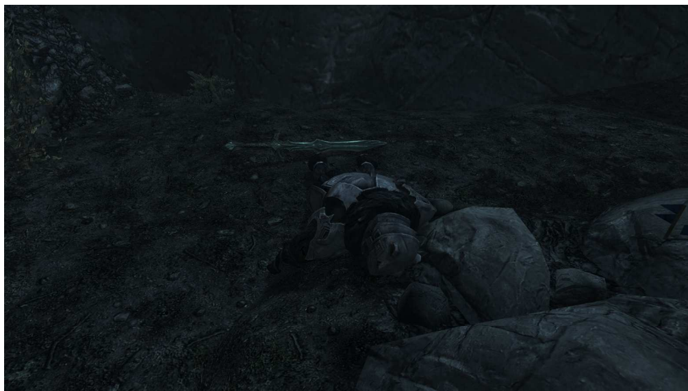
The mighty Dragonborn, dead from falling down a cliff in The Elder Scrolls V: Skyrim (Bethesda Game Studios, 2011) 677x381mm (72 x 72 DPI)

1 2 3 4 5 6 7 8 9 10 11 12 13 14 15 16 17 18 19 20 21 22 23 24 25 26 27 28 29 30 31 32 33 34 35 36 37 38 39 40 41 42 43 44 45 46 47 48 49 50 51 52 53 54 55 56 57 58 59 60