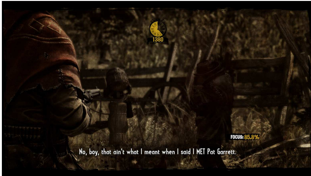
Winning a duel that never happened in Call of Juarez: Gunslinger (Techland, 2013) 677x381mm (72 x 72 DPI)