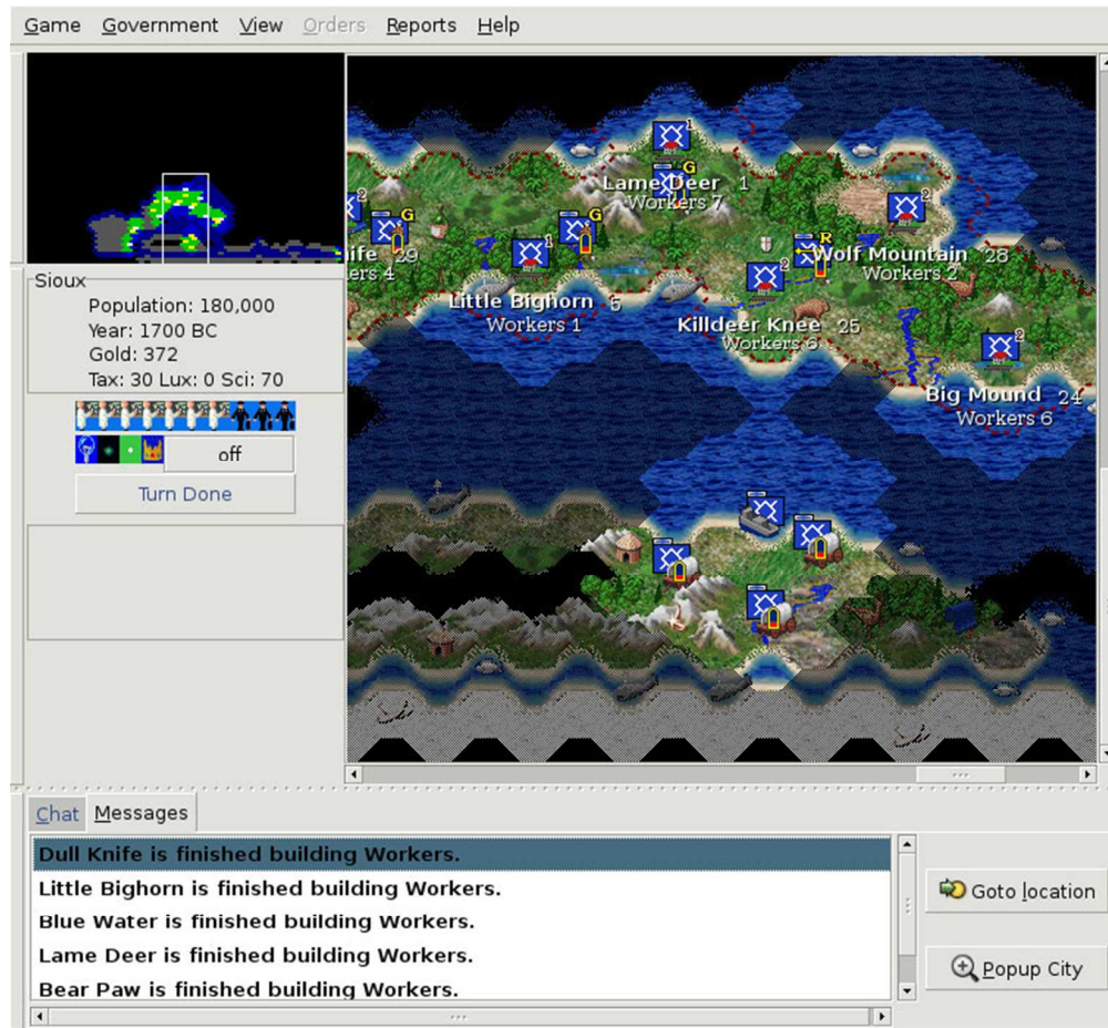
Fog of war in Freeciv (The Freeciv project, 1996). The two different shades of fog of war show two different types visibility. 192x177mm (100 x 100 DPI)

1 2 3 4 5 6 7 8 9 10 11 12 13 14 15 16 17 18 19 20 21 22 23 24 25 26 27 28 29 30 31 32 33 34 35 36 37 38 39 40 41 42 43 44 45 46 47 48 49 50 51 52 53 54 55 56 57 58 59 60