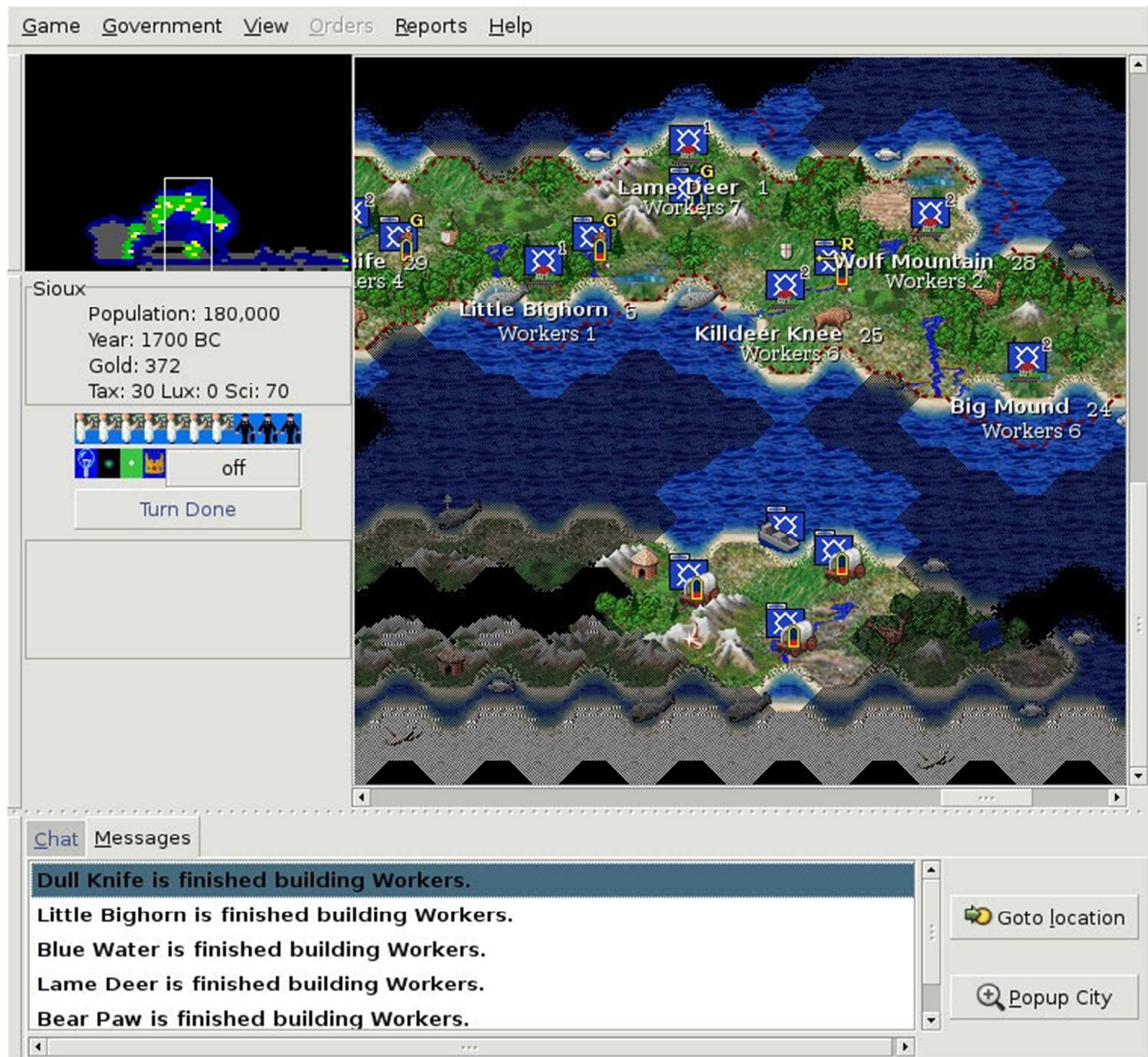
Figure 1 Fog of war in Freeciv (The Freeciv project, 1996). The two different shades of fog of war show two different types visibility.