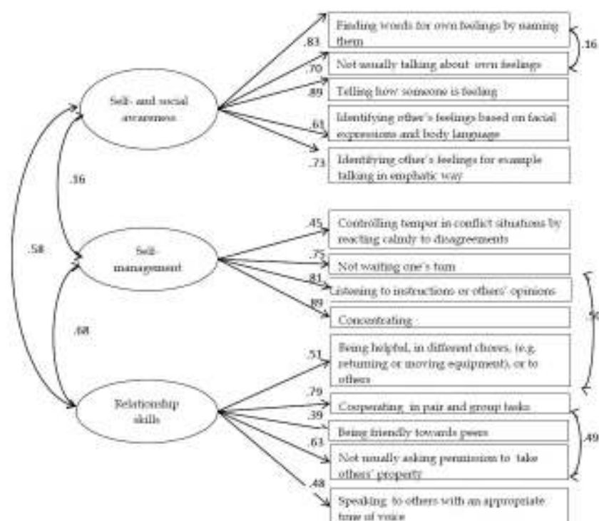
Figure 2 Measurement model of the hypothesized three-factor structure of the socioemotional skills observation scale

Paired samples t-tests revealed no differences in teacher-rated socioemotional skills between general kindergarten settings and the PE session. Independent samples t-test