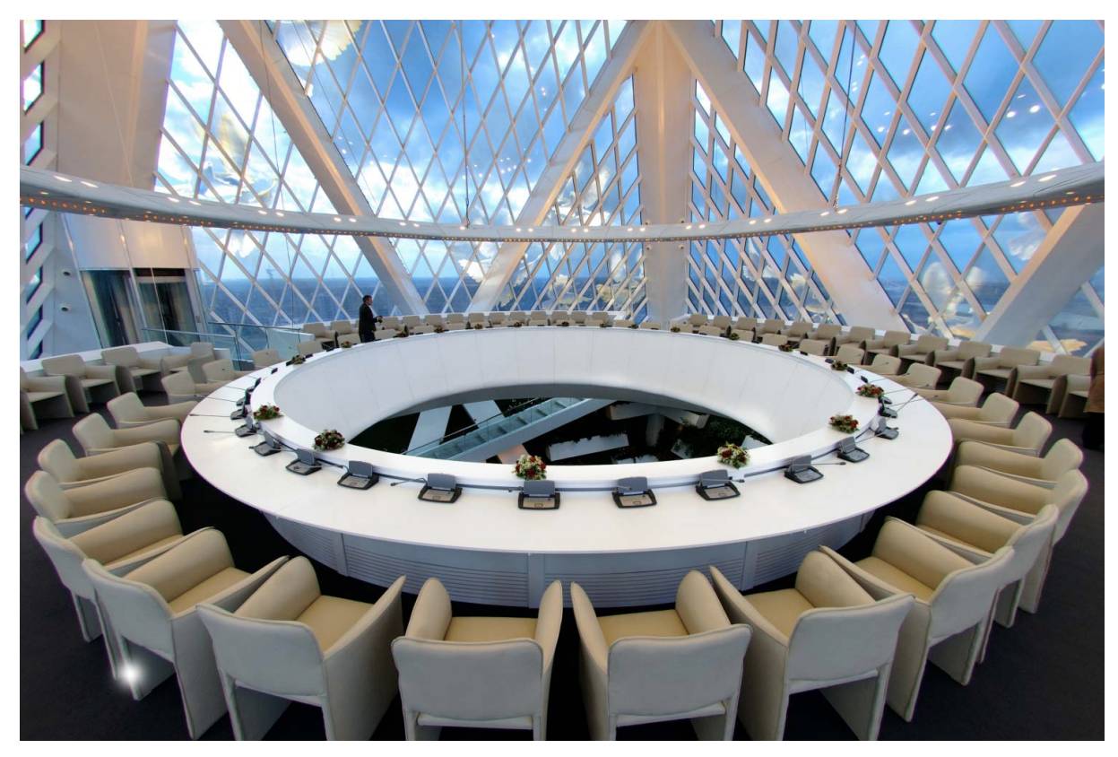
Conference Hall, Foster + Partners <sup>391</sup>

The hands of peace, the four inclined pillars, support the most important space in the Pyramid, the Conference Hall for the Congress of Leaders of World and Traditional Religions. The hands of peace hold the 'Cradle of Hope', the conference hall under the apex, an open platform above the central auditorium, in the air.<sup>390</sup>