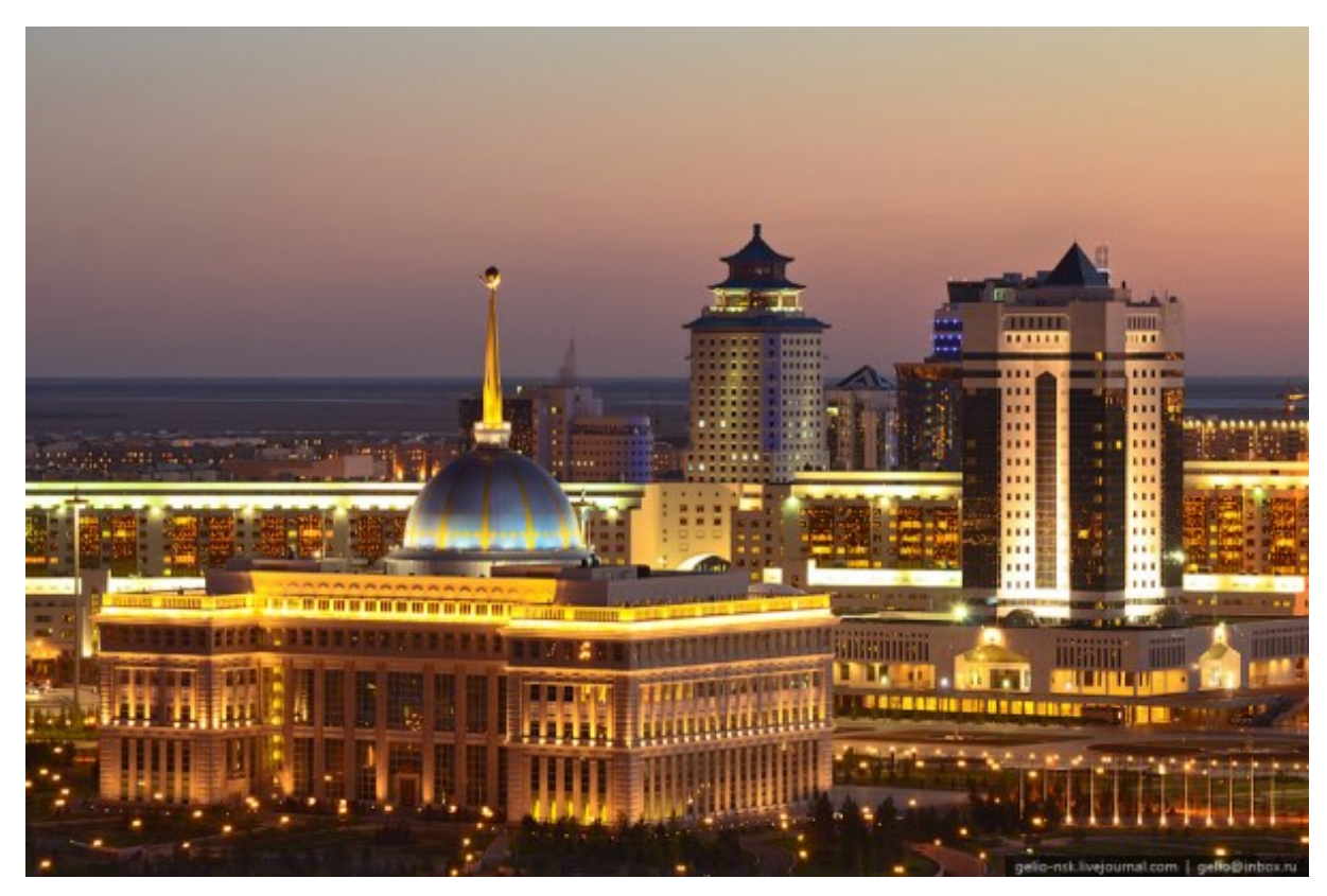
Left Bank and the Akorda Presidential Palace <sup>238</sup>

relocate the capital. The 10<sup>th</sup> anniversary of Astana was celebrated as a proof to president's right decision to relocate the capital.<sup>237</sup>