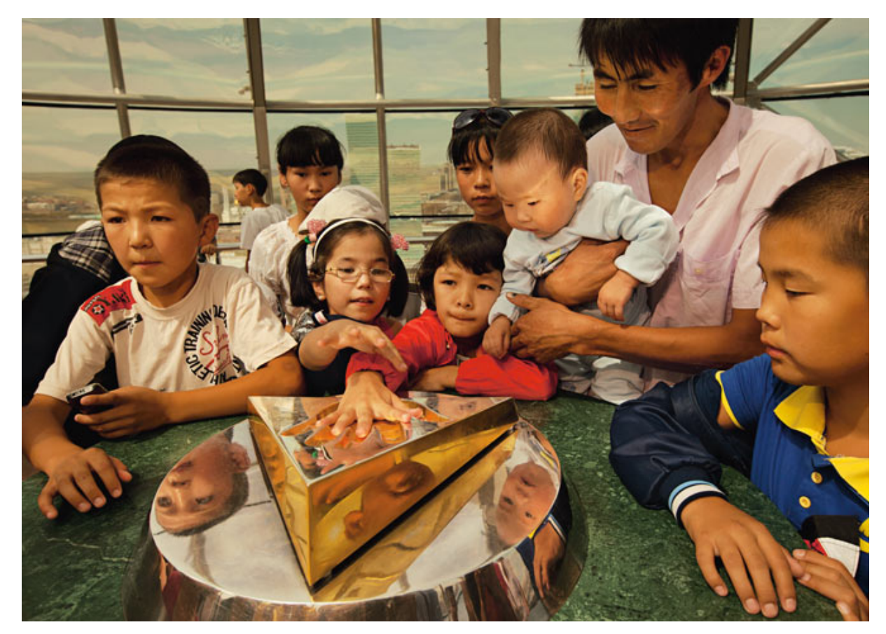
The Ayala-Alakan, Gerd Ludwig, National Geographic <sup>333</sup>

Alongside the Ayala-Alakan is the Bata monument, the sculpture of a globe that marks the first Congress of World and Traditional Religions held in Astana in 2003, when 17 leaders of world and traditional religions gathered for the first time in Astana to promote peace and harmony between different traditional and world religions.<sup>334</sup> The Congress was meant to settle interreligious disputes without violence and terror, and contribute to interethnic and interreligious peace and harmony. Since then, the Congress has been held every three years in Astana, in the Palace of Peace and Reconciliation that was specifically built for it.<sup>335</sup>