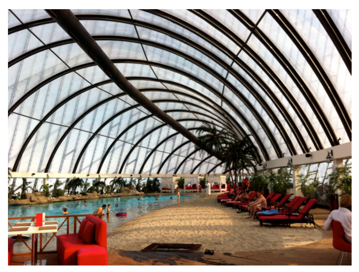
The Beach, Khan Shatyr 452

Khan Shatyr indeed brings together a wide range of activities. The mall has plenty of different entertainment and leisure facilities and flexible spaces that can be used for various programmes, events and exhibitions. The large flexible space at the core of the building is often used for various cultural events and exhibitions<sup>450</sup>, markets and celebrations<sup>451</sup>.