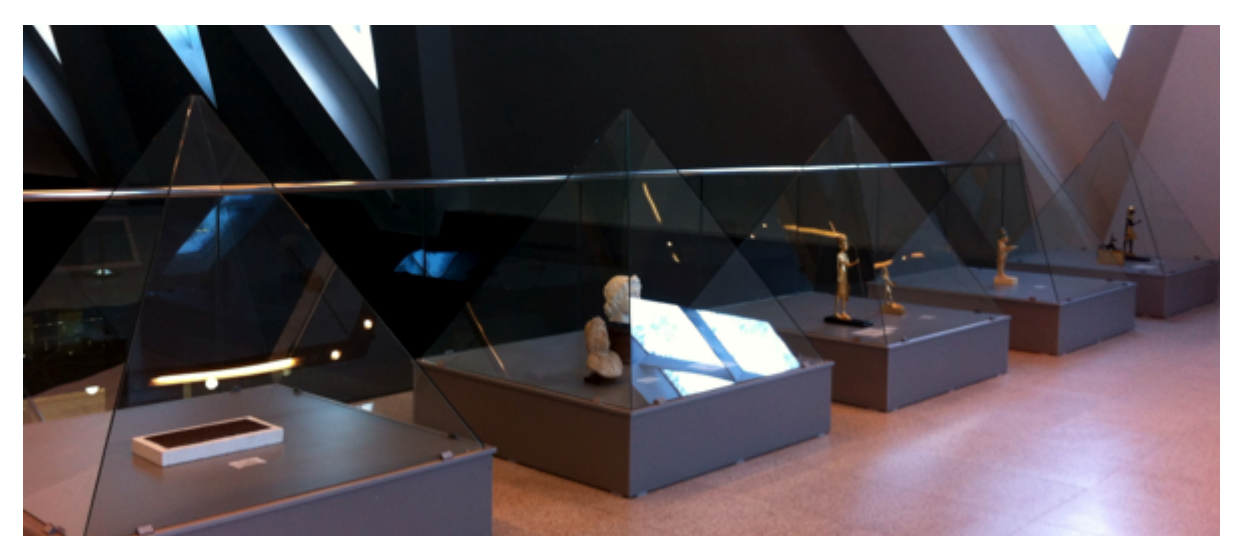
Display of the ancient cultures and historical objects <sup>396</sup>

Inside the Pyramid, in one of the galleries, there is a display of ancient cultures and historical objects<sup>395</sup>. The symbolism of the pyramid used in the building has been taken even to the inner decoration of the Pyramid by putting the objects in display inside smaller pyramids. Pyramids inside the Pyramid, sacred inside the Sacred or 'just' a clever decoration technique that fits the overall appearance of the Pyramid?