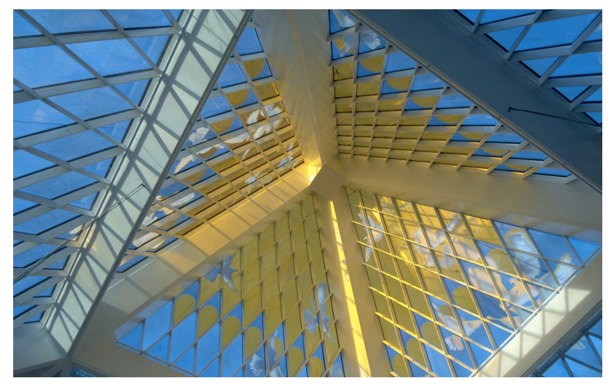
Upper Roof of the Pyramid, Foster + Partners <sup>386</sup>

The colours of the glass mosaic represent the colours of Kazakhstan's flag. The flag is one of the most important national symbols in today's world, and Kazakhstan uses the colours and the images of Kazakhstan's flag in various official celebrations and decorations, even in decorations on different kinds of official and nonofficial buildings, like the Pyramid. The images and the colours of Kazakhstan's flag have deep symbolism, well known to the citizens of Kazakhstan, particularly to the ethnic Kazakhs<sup>387</sup>.