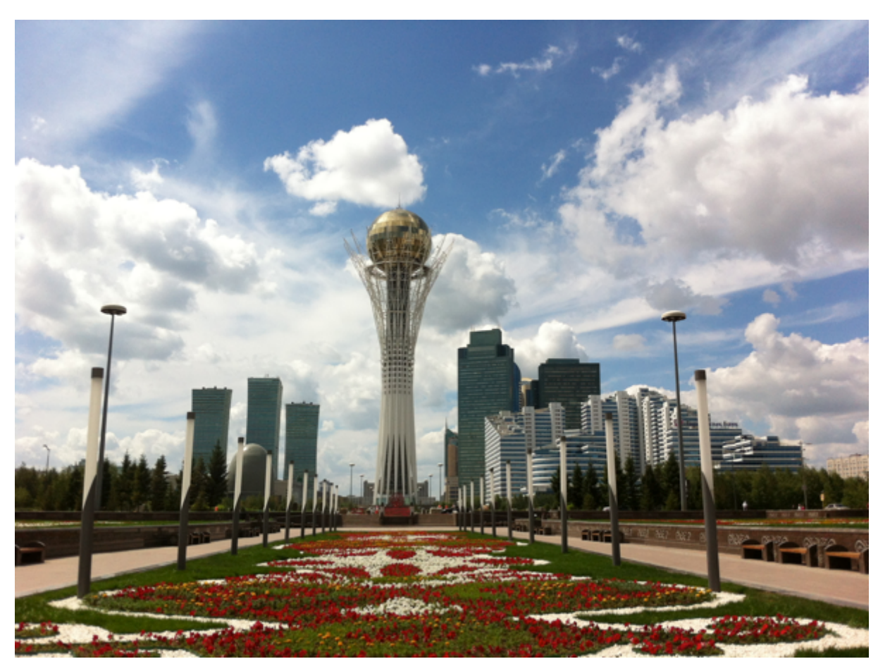
Baiterek, Astana 280 281

Baiterek, in Kazakh "a giant poplar tree"<sup>278</sup>-and in Kazakh and Persian mythology, "the Tree of Life"<sup>279</sup>, is the official symbol of Astana, the symbol of the New Kazakhstan.