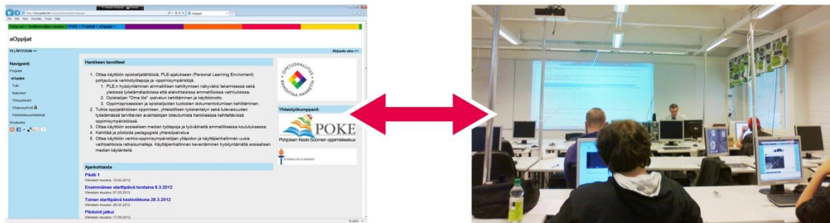
Figure 1. The technological environment and technology-enhanced classroom context.

five phases in which the blog tool was actively used for reporting and reflecting: (a) choosing a Linux distribution according to each learner's own interests and skills; (b) installing the selected Linux distribution on the computer and comparing different students' experiences on the installation process with the installation of Open Suse Linux ('Was it easier/more difficult?', 'What were the differences?'); (c) becoming familiar with the use of their Linux distribution in the workstation environment; (d) becoming familiar with other students' installations; (e) making a questionnaire (for other students) on the issues concerning installation and writing a summary of the questionnaire responses. The task was carried out over the course of five days (altogether, 10 hours of face-to-face interaction). The aim of the learning task was to become familiar with the issues concerning installation and the actual operation of different Linux distributions.