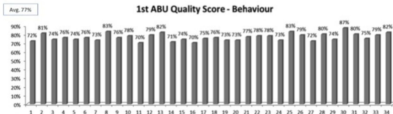
Figure 4: 1st job evaluation score - Behaviour