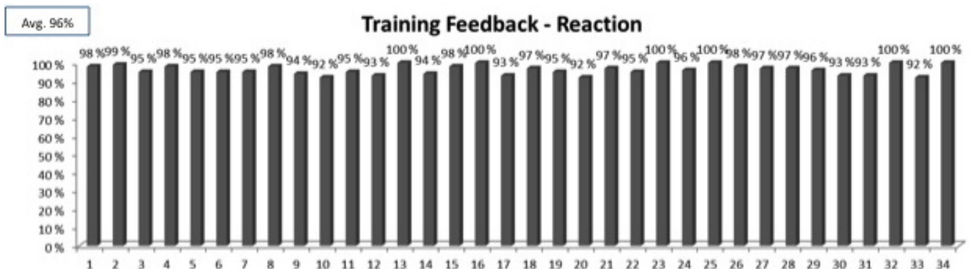
Figure 2: Training feedback - Reactions

Next step of Kirkpatrick model showed some interesting results. Figure 4 (p. 11) is about the results captured at behavior level for all batches. So, the training which was considered as 96% effective was actually only 77% effective at Behavior level which was almost 19% less than actual scores recorded at reaction level. So, answering RQ-2 (How effective are call center new hire training programs at different levels of Kirkpatrick’s model?), analysis revealed that organizations that are considering reaction as the only parameter to gauge effectiveness of training can be highly misled by results as reactions of trainees after end of training do not reflect the true and complete picture of actual training effectiveness.