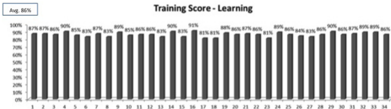
Figure 3: Training score - Learning's