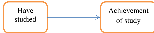
Figure1. Process-Product model for learning

results will only emerge if the student has spent time effectively studying the subject to be tested (i.e., the effectiveness of the learning process is the single most important factor).