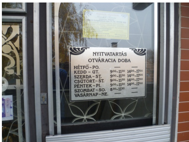
Figure 5. Hungarian as the preferred code in Vásárút

The name of the owner is displayed in many commercial signs. At times, Hungarian names (and the Hungarian order of last name followed with the first name) are used. However, most female owners have kept the Slovak -ová suffix (female names without it were allowed in 1994, see Lanstyák and Szabómihály 2005: 58). A Hungarian cultural activist stated that she would have dropped the suffix if she had not been a business owner. According to her, she did not want to take the risk of being subjected to too many inspections for this kind of display of Hungarian-ness. Business names are most often international expressions in some Indo-European orthography (e.g. Ferrofruct , Judi Bar ), Slovak names are used rarely (e.g. Jednota ). There were two cases of Hungarian business name use in bilingual signs in Vásárút. In the first one, the Hungarian orthography is used ( Korona ‘Crown’ for a pub), in the other the name has been translated to Slovak: Patkó – Potkova [sic!] (‘horseshoe’ for a restaurant).