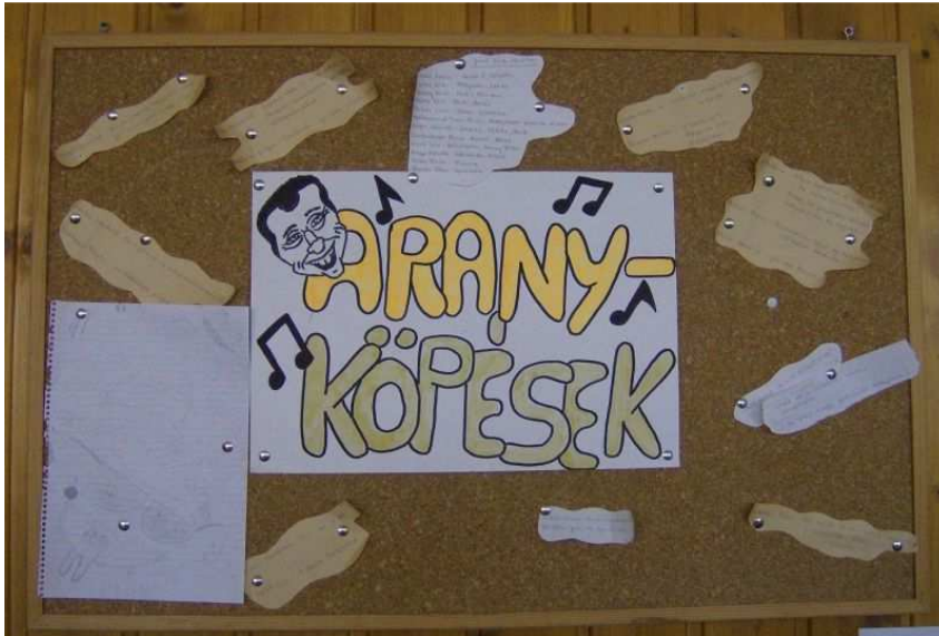
Figure 13. Collection of wisecracks (School 2).

In excerpt (7), András has challenged the background of the teacher's playful threat, expressing doubts concerning the physical power of the teacher.