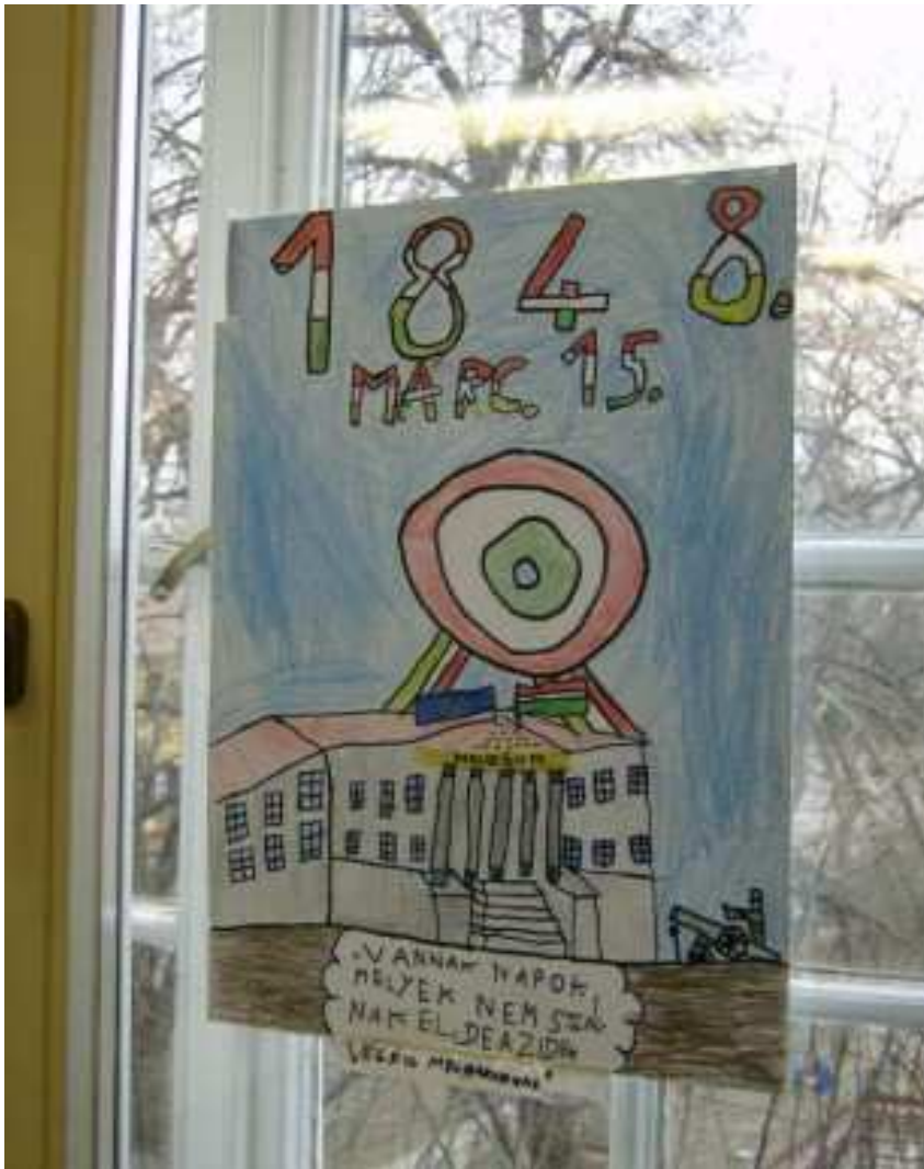
Figure 5. A reconstruction of codified narratives (School 1).

The student had written the emblematic date of the national holiday (15 March 1848) on the top of his or her drawing, colouring the letters and numbers according to the national tricolour. In the centre, a large cockade can be seen. At the bottom, s/he had highlighted one of the locations of the revolution: the National Museum in Budapest. Tradition has it that the great Hungarian national romantic poet Sándor Petőfi presented his poem Nemzeti dal 'National song' on the stairs of the museum. (According to experts, this is a myth and cannot be proved to be a historic fact; see Debreczeni-Droppán 2007.) The poem was printed as a handbill on the first day of the revolution and the text itself and its author became an emblematic symbol of the movement. In another fragment of the narrative, on the right, a soldier stands next to a cannon. This can be interpreted as a reference to the war of independence (1848–1849). The student had illustrated the museum building in its present form, with the Hungarian and the EU flag on display. Thus, the drawing depicted the place of commemoration. In another commemorative element, the student had quoted an excerpt from a poem Március idusán 'In the middle of March' written by Gyula Juhász (the translation is mine):