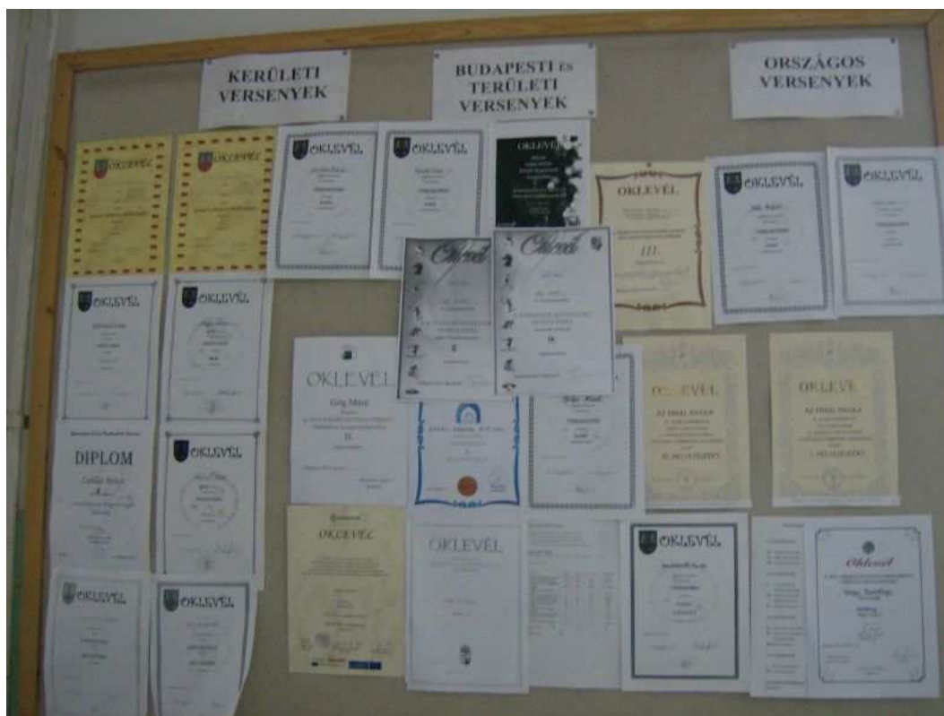
Figure 1. Wall of fame: certificates in School 1 (from left to right, for city district level, metropolitan and nationwide level competitions).