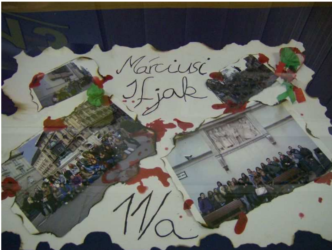
Figure 7. 'Young people of March' (School 2).

Hungarian national narratives such as the history of Hungarian revolutions provide key resources for national, institutional and personal identity construction. They are intertwined with the community events in which they are retold. Thus, the self-presentation of the community members as the maintainers of a Hungarian tradition is on display as well. As narrated by my guide in School 2, the classes visit various places of commemoration (e.g. statues, memorials, etc.) when the anniversary of the revolution is approaching. These tours are initiated by the teachers. The students are expected to take photos of themselves as a group, demonstrating that they have visited the given sight. As a task, they create and display a handmade tableau with the photo of their group on it. One of the classes entitled their work Márciusi ifjak 'Young people of March' (Fig. 7). This expression traditionally refers to the 1848 revolutionaries, but on the tableau, it is the students and not the historical personalities who are portrayed. Thus, with the use of this expression and the symbolic appearance of the blood of the martyrs, the students construct a sense of the communion between them and the revolutionaries.