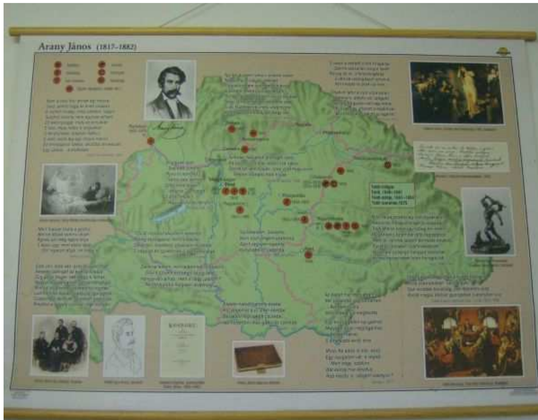
Figure 10. The life of poet János Arany – mass-produced print (School 1).

After the introductory level of primary education, the symbolic role of the standardized variety is strengthened by mass-produced and handmade tableaux. This process of legitimation is similar to the visual reconstruction of certain narratives from the history of the Hungarian nation (as seen in the above section) and the Hungarian literary tradition. For example, as Fig. 10 and 11 illustrate, there are tableaux on display which highlight personalities who are considered the most eminent contributors to the written Hungarian language.