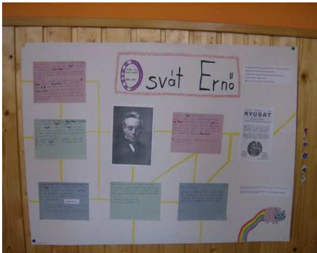
Figure 11. The life and works of writer and editor Ernő Osvát – as retold by the students (School 2).

In School 2, there was no special classroom for Hungarian studies, but similar tableaux were on display. For example, the life and activity of writer and editor Ernő Osvát was summarized (Fig. 11). These handmade artefacts contribute to the internalization of standardized life narratives through highlighting and visualising certain events and the symbolic images linked to those events (cf. section 5.2.1 and Fig. 5, 7).