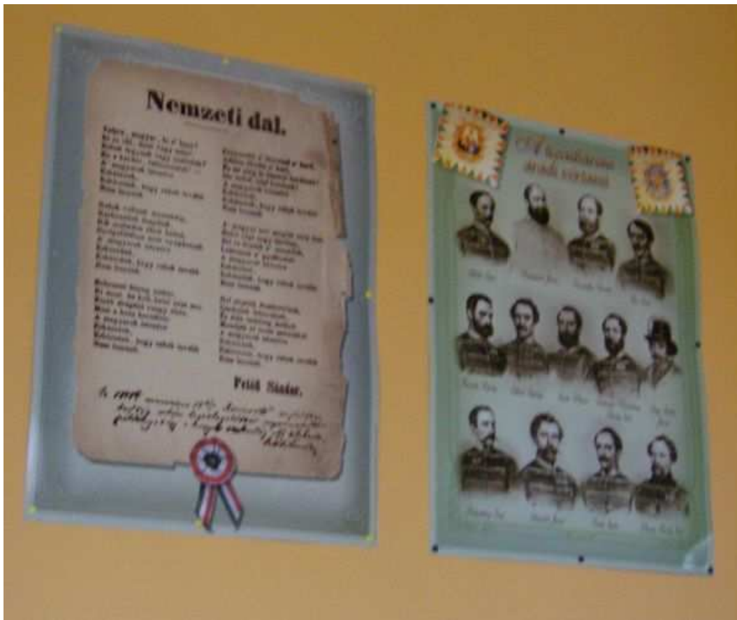
Figure 6. Mass production of canonic texts and idealized pictures of highlighted personalities (School 2).

As Johnson (1980) has observed, handmade artefacts are more common in classrooms for younger children. Adolescents are usually exposed to the visual stimuli of mass produced signs. For example, in School 2, a print copy supports the reconstruction of the history of the 1848 revolution (Fig. 6). From left to right, it offers a chronological summary – in a manner similar to the previously presented handwork. First comes the text of Nemzeti dal ‘National song’, and on the right, there is a tableau of the generals who were executed on 6 October 1849, after the failure of the war of independence. They are considered the martyrs of the war of Hungarian independence.