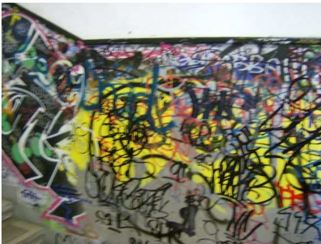
Figure 17. Legally produced graffiti (School 3).

In this excerpt, Zsuzsa articulated the central position of the organization – in other words, the controlled use of public spaces. Reserving the right of regulation to the teachers, she added that if regulation was less strict, control would be hard to sustain.