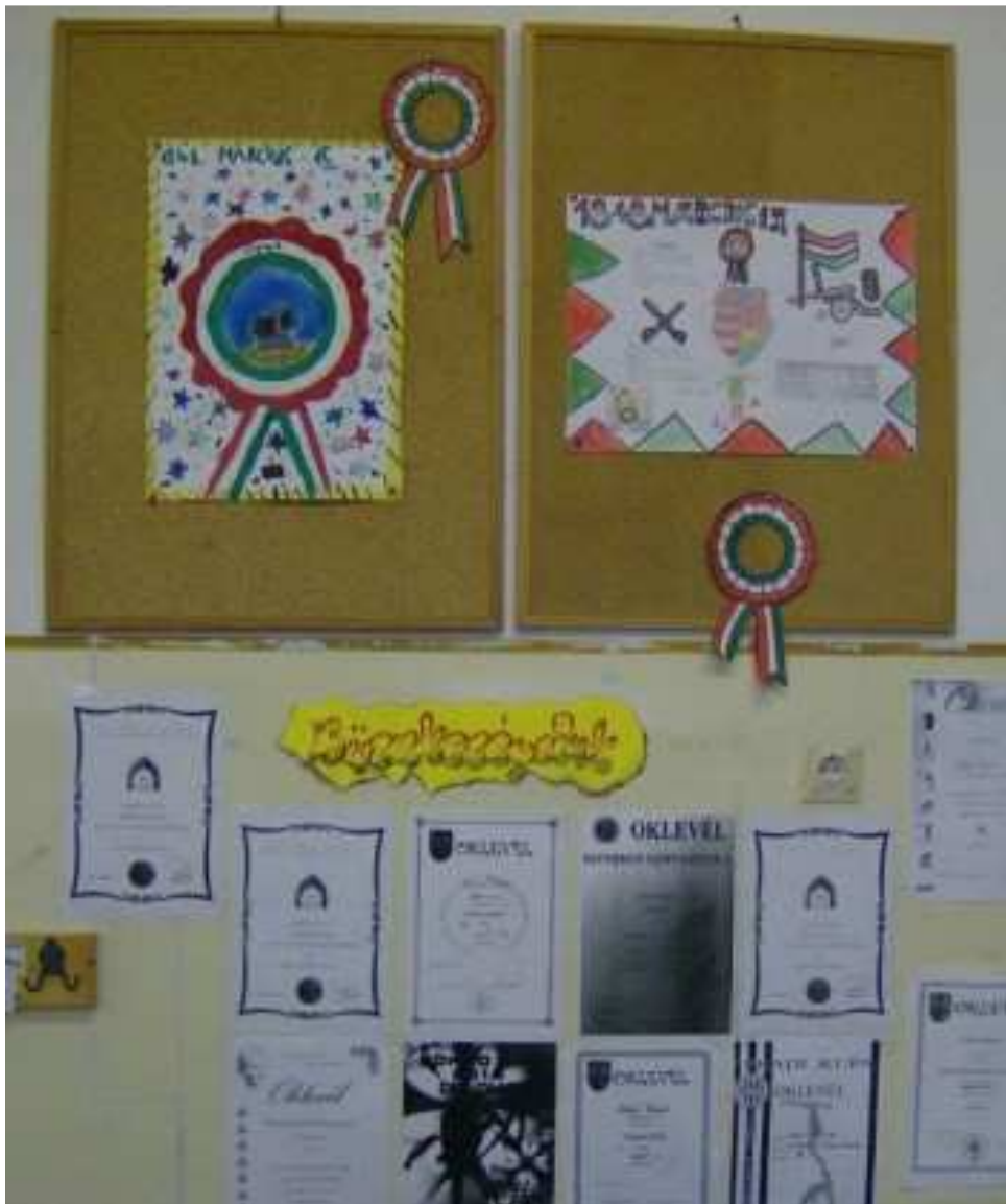
Figure 4. National symbols and copies of certificates in School 1.

In the following paragraphs, I present various practices reproduced in state schools for reconstructing national narratives. These narratives are considered to be important elements of Hungarian national identity. As an example, I provide analysis of the visualisation of the 1848 revolution which is narrated as an emblematic episode in the construction of the Hungarian nation state. The photos were taken in March 2013, a few days before (in School 1) and after (in School 2) the commemorative ceremonies organized by the schools. (15 March is the memorial day of the revolution and it is a public holiday in Hungary.)