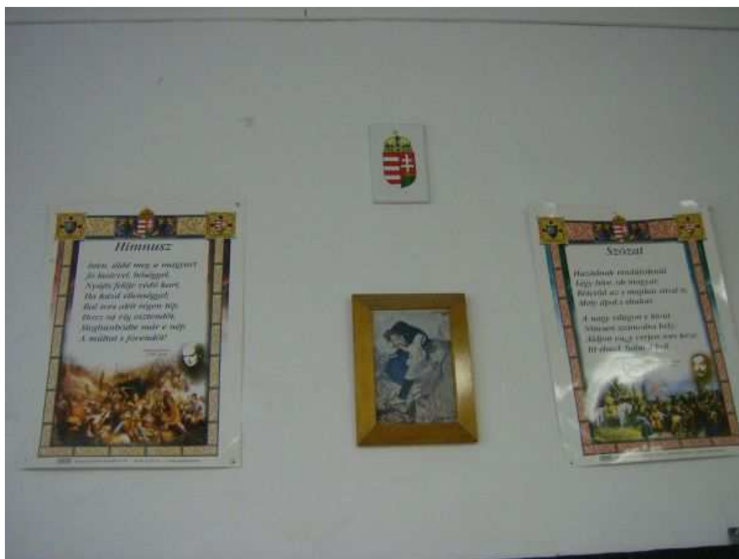
Figure 2. National symbols above the blackboard (School 1).

According to a teacher in School 2, these symbols are parts of the normative (i.e., average, not extraordinary) schoolscape. During the interview, after entering a classroom, she started to describe the place, pointing to some photographs depicting old Budapest, and then she added (interviews were conducted in Hungarian; I provide the excerpts in my own translation):