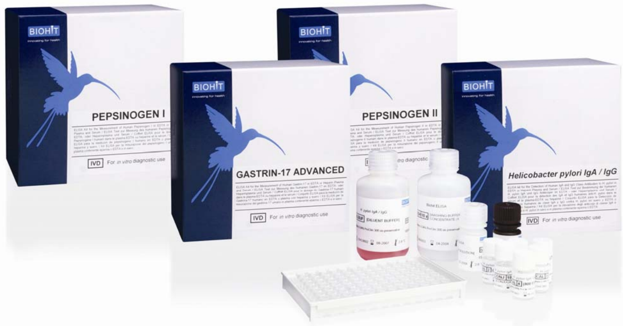
Exhibit 4. Gastro Panel Diagnostics by Biohit.

In addition to large global companies, the companies in the diagnostics market include smaller companies such as Biohit, which specialize in particular diagnostic fields. Harnessing the huge market potential of Biohit’s diagnostic products requires proactive sales and marketing, and also cooperation with strong partners who specialize in diagnostics.