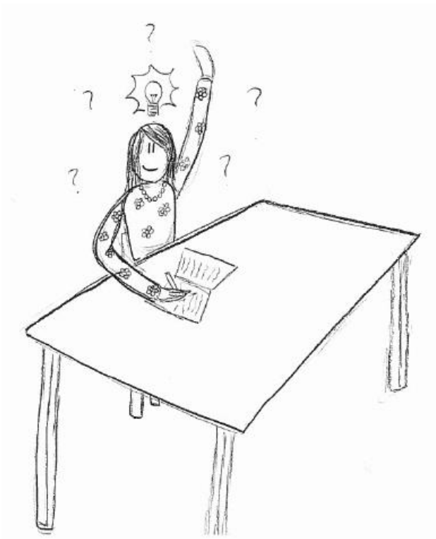
Figure 3. The “good language learner”

Speaking English and presenting positive orientation towards studying the language were seen as presentations of being a “good language learner”. Especially the fifth graders reported about their interest in and enthusiasm about studying English. Some of them described themselves in the questionnaire as happy English learners, which suggests that they had positive attitudes towards studying the language. Although the sixth graders seemed less open about reporting their attitude, most of them regarded learning English as important. In spite of this, it was not always fun, which caused contradicting feelings and investment. For some pupils, the reluctance to express their opinion might have been affected by the fact that the researcher was also their teacher.