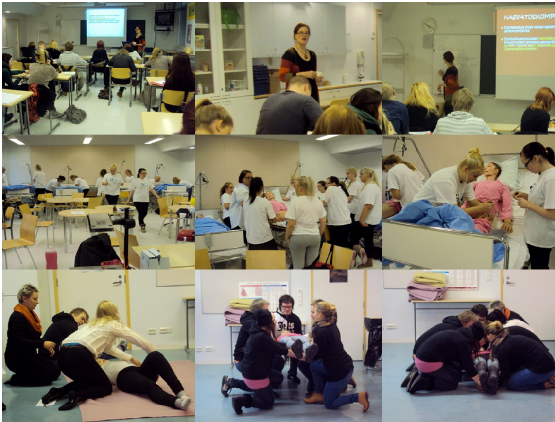
Figure 2: Observation of instructional sessions

The two key perspectives to be researched were those of the student and of the teacher . The teachers’ views were firstly investigated through a survey (n=26). The aim was to map their attitudes and preferences relevant to the development of educational settings and instructional methods. A set of questions focused on the goals of education and another one probed factors that have impact on the staff’s wellbeing.