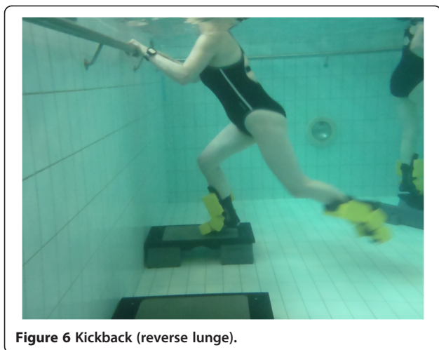
Figure 6 Kickback (reverse lunge).

work of 30 and 45 seconds with large boots. Week 12 will consist of one session barefooted, one with small fins and one with large boots, work duration will be 45 seconds per set. The frontal area of aquafin resistance fins is 0.0181 m 2 and that of the large resistance boots 0.075 m 2 . In a previous study the drag experienced during seated aquatic knee flexion/extension exercises in healthy women was triple with the large boots compared to the barefoot condition. Additionally, a significant increase in EMG activity was seen with the large boots compared to no boots [117,122].