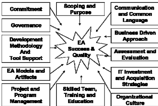
Figure 2. Updated Set of Potential Critical Success Factors for EA

3. Consolidation of the Results: The results from both the empirical study and the literature review were combined and a set of twelve potential CSFs was accomplished (Figure 2). In this step, some factors were also combined. Because 'Communication' is supported by a 'Common Language', these two factors were combined. In a similar basis, also the 'Development Methodology' and 'Tool Support' were combined, as well as 'Skilled Team' and 'Training and Education'. Additionally, even though 'IT Investment and Acquisition Strategies' (U.S. Department of Commerce, 2003; U.S. Government Accountability Office, 2003; State of North Carolina Office of Enterprise Technology Strategies, 2003) can be seen as a part of 'Governance', we positioned it as a separate CSF to highlight the primary objective of EA: the need to develop IT systems that enable and support the organization to achieve its business goals and objectives successfully. Furthermore, the characteristics of each CSF were formulated as questions.