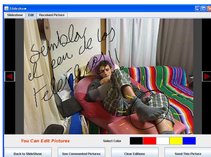
Figure 2. Edit function of the Pictures' Call receiver system.

Finally, receiving commented pictures of oneself, which the user has not seen yet, serves as a mirror that supports personal awareness. This can support the eighth principle—self-growth, not dependency. The commented pictures are not automatically erased but remain available for further review. However, the receiver of the commented picture can delete the edit, or edit the edit and resend it, which encourages further communication as well as the first principle—giving, not exchange or egoism, second principle—care, not involuntary love—and the third principle—responsibility, not irrationality.