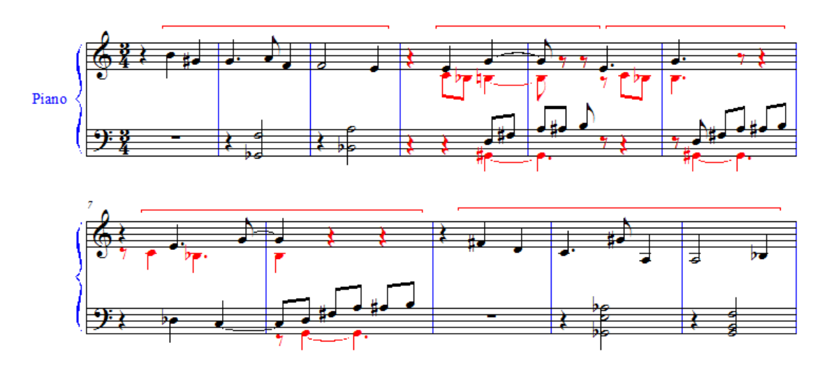
Figure 1. Excerpt (measures 1-11) of the Shoenberg's piano piece Op. 11, no. 1 used in the present study.