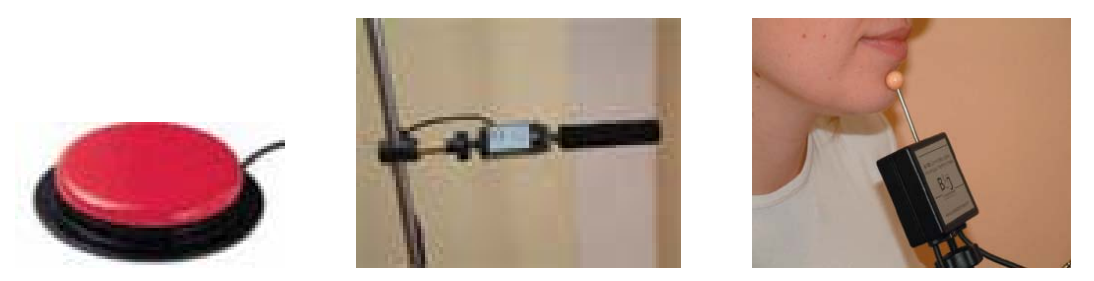
Figure 3. Examples of various switches (activated by the hand, head, and chin).

However, this technology has a technologic problem: its low bandwidth. This feature affects a normal communication between the user and the system; the pair action-reaction is not instantaneous (with action meaning "what the user does" and reaction "the system feedback") and can frustrate the user with a lot of dead time.