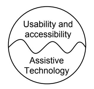
Figure 2. Design for all involves a synergy between usability and accessibility combined with the appropriate user dependant assistive technology.

Therefore, design for all also involves assistive technologies to overcome any impairments of a user. In the context of this paper, assistive technology refers to the (special) computer hardware and/or software used to increase, maintain, or improve the functional capabilities of individuals with disabilities (Blaise, 2003). Examples of computer assistive technology devices are Braille readers, screen magnification software, eye-tracking devices, and so forth. In spatial accessibly, a wheelchair is an assistive technology device.