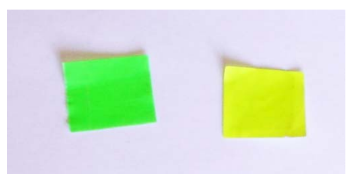
Figure 8. Fluorescent color marker samples.

Currently, WebColor emulates the functions of a switch, a joystick (to control the mouse pointer), and a mouse. Color markers are usually fluorescent-colored pieces of paper (see Figure 8) that can be attached to any surface or to the user's body.