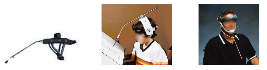
Figure 6. Examples of head stick pointers.