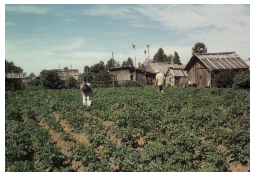
FIGURE 2 Collecting Colorado potato beetles in a potato field in Russia.