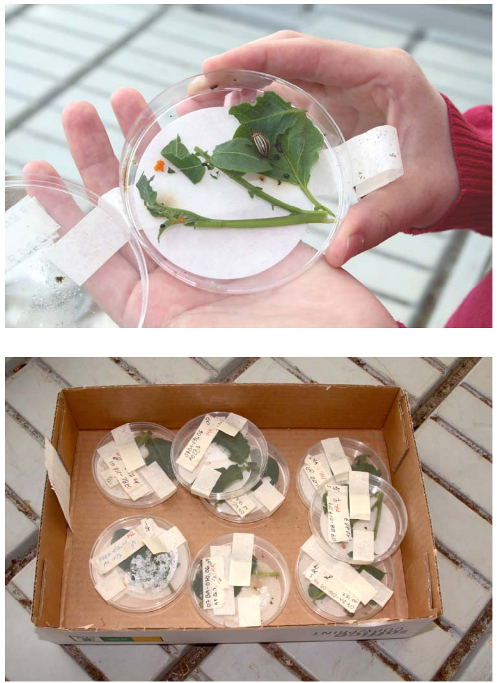
FIGURE 4 Colorado potato beetles reared on Petri dishes.