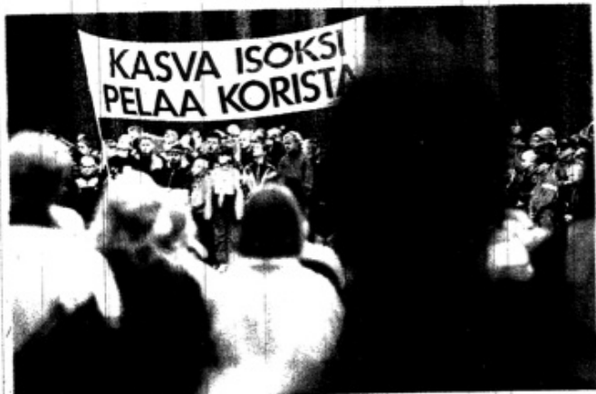
Koripalloittajien ja -poikien banderoli kertoo kaiken oleellisen.

- Ehkä perheillä ei ole varaa ulkomaanmatkailuun kuten joskus aiemmin: jos nuori saa viikon täysihoidon 350 markalla ja sisäraennuksineen vieläkin halvemmalla, en jätä hintaa kovinkaan suurena. Vaikka kaikenlaisia leirejä onkin paljon, Pitkis-Sport näyttää pitävän asemansa yhtenä maan suuremmista, Aalto mietiskelee tyytyväisenä.