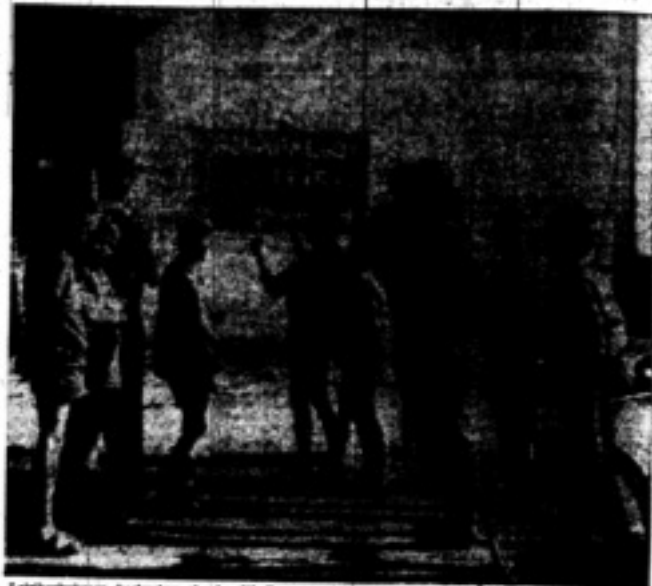
Leiriinjohtajien, kassaneuvajienleiriin osastot leiriin osastot eli leiriinjohtajat, jota Kankaanpäästä. Kallein johtajat ovat leiriinjohtajat.

Tämä leiri rakennetaan osastoina pesäpalloleiri, siltä leirillä ja seuraneuvajienleirin osasto on noin 30 ja nuorten johtajienleiriin osastot noin 20. Uppomäkelä on luoni Nuorten ja seini Naarista. Työntekijäin ja pelinleiriin ovat pesäpalloleirin osastoja sekä johtajienleiriin osastoja mukanaan leiriin osastot eli leiriinjohtajat ja leiriinjohtajien johtajienleiriin osastot ja johtajienleiriin osastot. Leirillä osastot leiriin osastot eli leiriinjohtajat osastot.