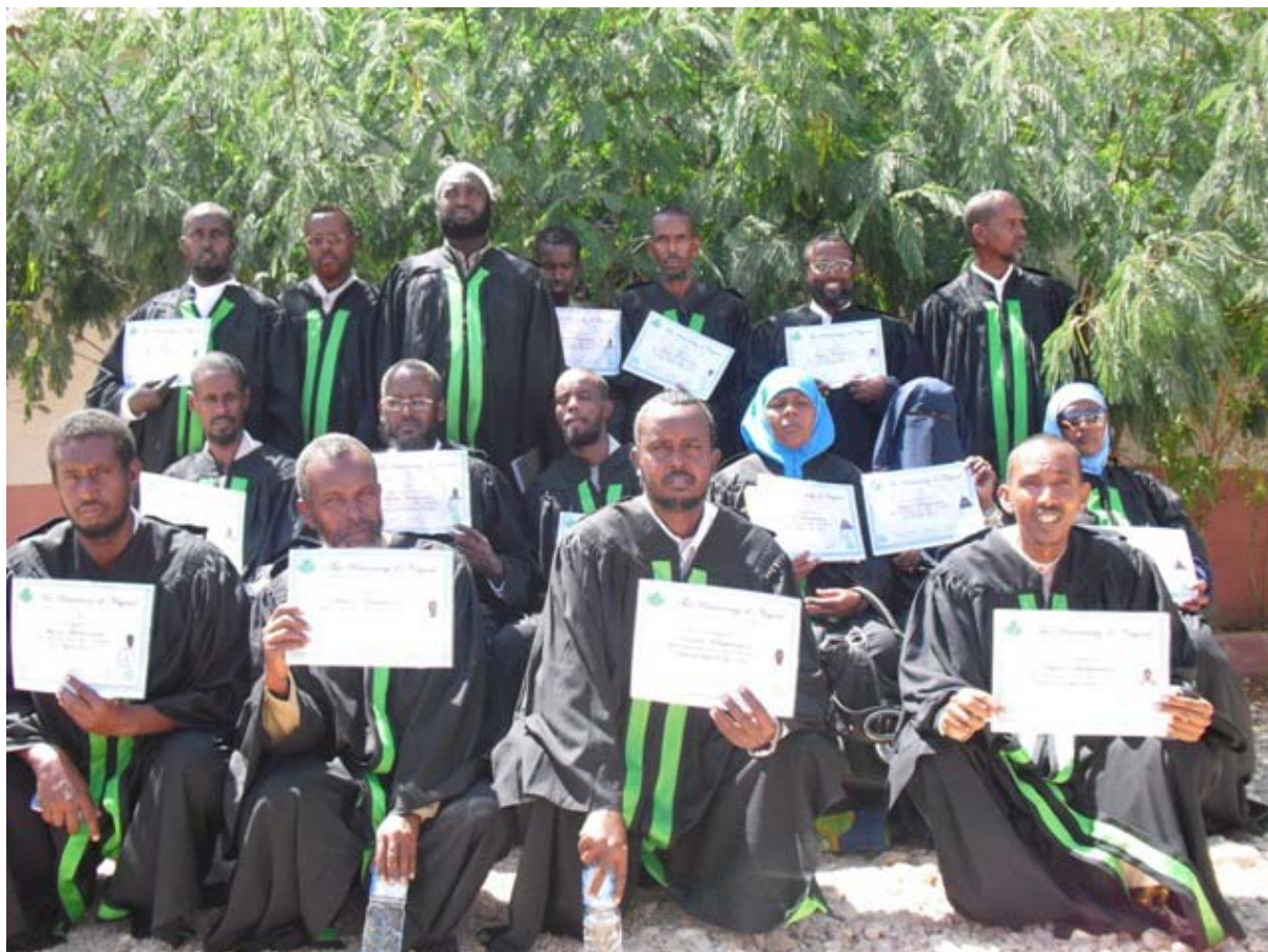
Figure 7. Graduation Ceremony, Jamacadda Nugaal, Laascaanood 2009.