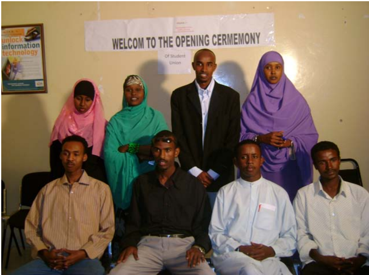
Figure 4. Students' Union, Jamacadda Geeska , Hargeysa, 2008.

Hargeysa, 7 April 2009). In her eyes, education helped to stabilise peace. Like the founders of Jamacadda Geeska , she