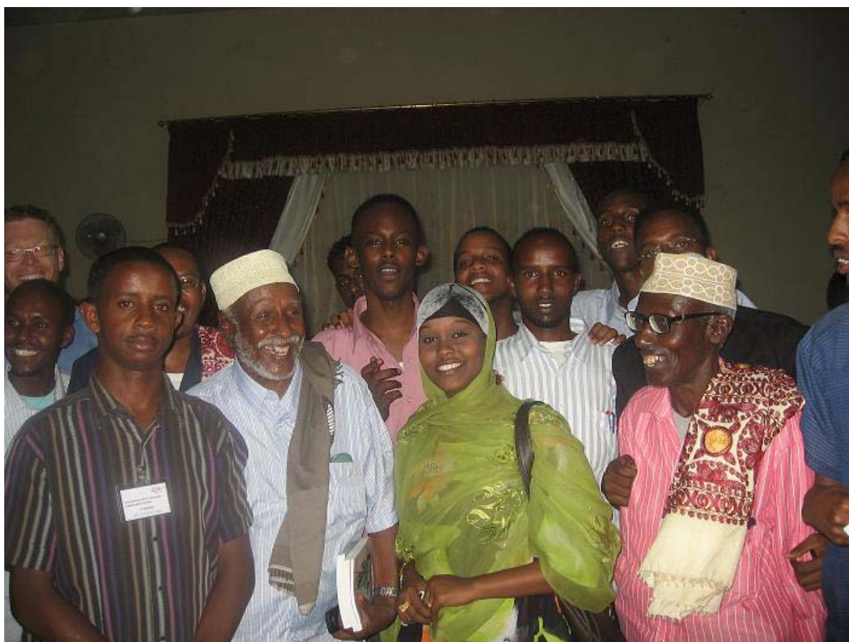
Figure 3. Students of Jamacadda Geeska together with the poets Hadraawi and Hurre at Habeenka Sugaanta Geela , Hargeysa, 2009.

students of Jamacadda Geeska ), who sat separately on the two sides of the hall. The poetry was enormously entertaining and represented a Somali culture that was only peripherally touched by Islam. Expressions such as aakhiro nin aan geel lahayn lagama amaaneyn ('a man without camels is not welcome in the hereafter') seemed to be quite far from scriptural Islam, and some of the love poetry recited later in the evening definitively went far beyond the limits of conservative Islamic morality. The audience, however, followed carefully; people's reactions oscillated between hushed absorption and hearty laughter.