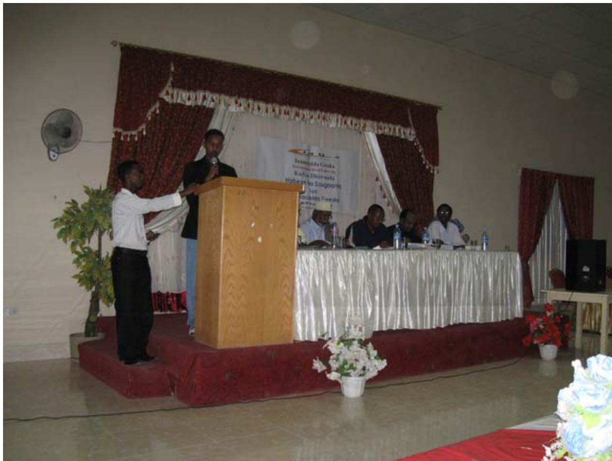
Figure 2. Member of the student union of Jamacadda Geeska recites the Koran at the opening of Habeenka Sugaanta Geela , Hargeysa, 2009.

people very personal questions that deeply penetrate their private lives' (ibid.). The issue of women's rights was also problematic. 'They [the NGOs] talk about women's rights; but there are limits to these rights according to Islam. Of course this leads to long discussions' (ibid.).