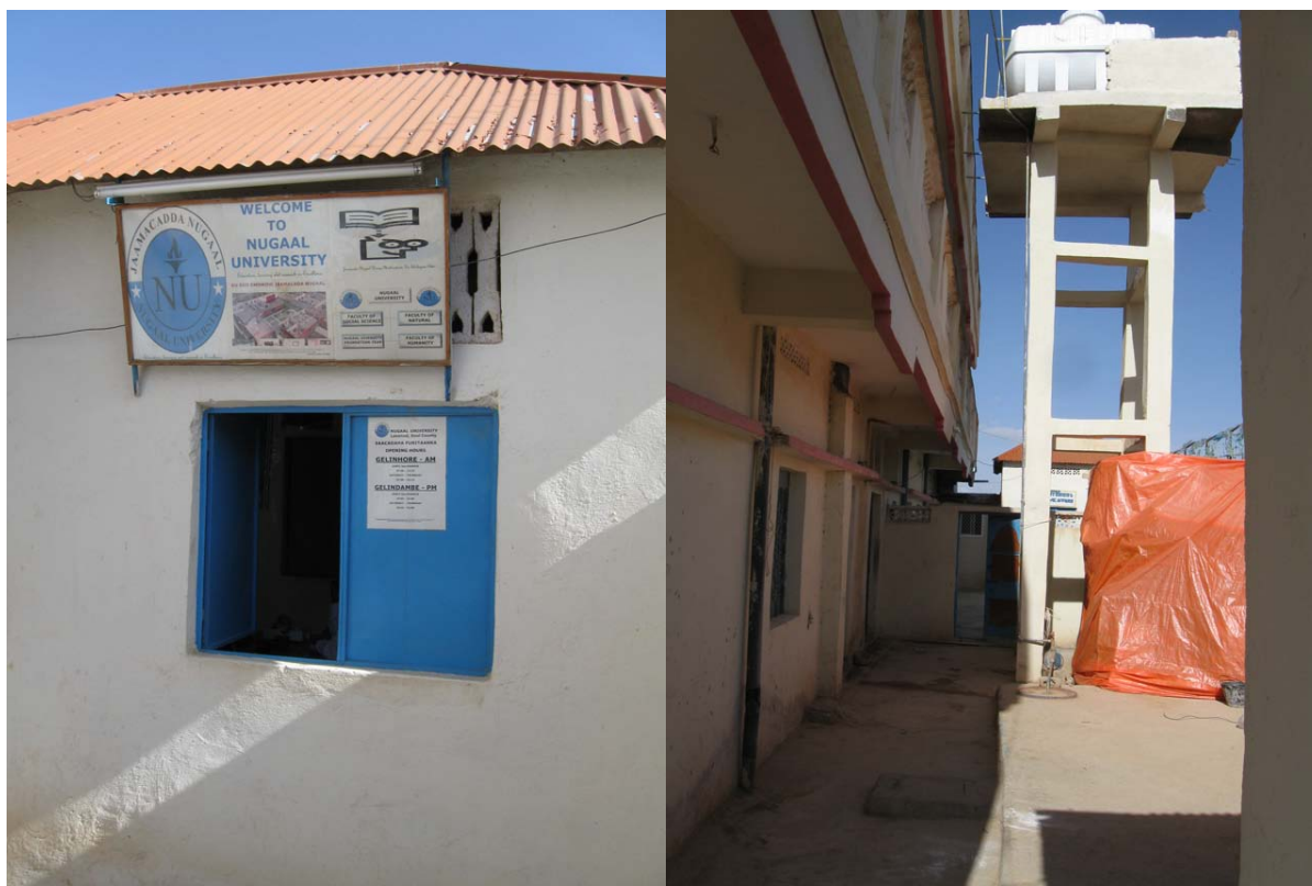
Figure 5. Jamacadda Nugaal , Laascaanood, 2009.

men and women, were among the students. They had concluded their previous education before the state collapse and now continued a kind of second education (Interviews Ciise Ibraahim Muuse, Laascaanood, 15 April 2009; Cabdinasir Abu Shaybe, Laascaanood, 15 April 2009).