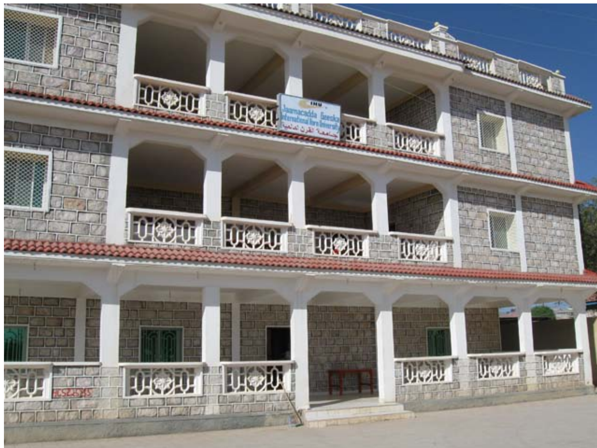
Figure 1. Jamacadda Geeska , Hargeysa, 2009 (© Hoehne).

could have been an alternative location, a number of well functioning universities already existed, despite the ongoing civil war there. Certainly, the fact that two of the four founders had family relations in Somaliland also played a role.