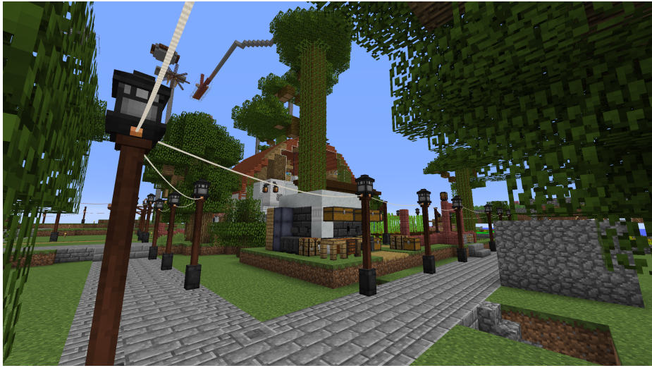
Fig. 2 Road networks, and connection of the electric transmission line to the network by campers.

Students also prepared a part of the electrical network created in Minecraft in a practical lab session by installing a solar energy source, as the theme of the camp shows (Fig. 1). On the last day of the camp, the participants could take part in an excursion as per the theme (Fig. 1), where they could visit a solar park so they could compare the solar park built in Minecraft with a real and actively producing park, thus creating a learning chain and connecting the technology created in the virtual space, the in reality, with a faithful significant other.