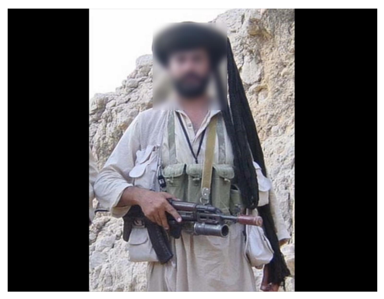
Figure 5.3. A visual image taken from song Pada pada warna

Political position or the degree to which an ethnic group is recognized in national-level governance significantly affects who relates more positively with their national identity (Wimmer, 2017). At the national level, the greater the proportion of the population that is denied participation in government will affect the ethnic minority groups to affiliate themselves with nationalism. Similarly, in the case of Baluchistan, the centralist structure of Pakistan's government makes it hard for smaller provinces such as Baluchistan to fit within it. That is due to the distribution of resources and representations to both elected bodies and government structures depends on population, and Baluchistan, despite having 44% of Pakistan's territory, inhabits only 5% of Pakistan's overall population (Ahmed & Baloch, 2017), so the province is not presented proportionally in the central government.