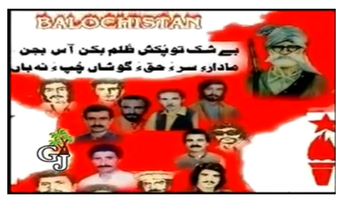
Figure 5.4. A visual image is taken from the song Inglaab

Enforced disappearance is frequently followed by coercion and threats, indicated here by the noose, which signifies the potential threat imposed on people who fight against injustice. Furthermore, enforced disappearance is a tactical way for the government to spread fear to suppress a targeted section of the population (Sarkin & Baranowska, 2018). This fear is indicated in the song, which reflects the counter approach to deal in a way that no matter how many Baloch people are abducted or killed by the state. The same strategy has been applied in many countries like "systematic disappearances in Latin America" (Sadat, 2013) and Chile (Anguilar & Kovras, 2018).