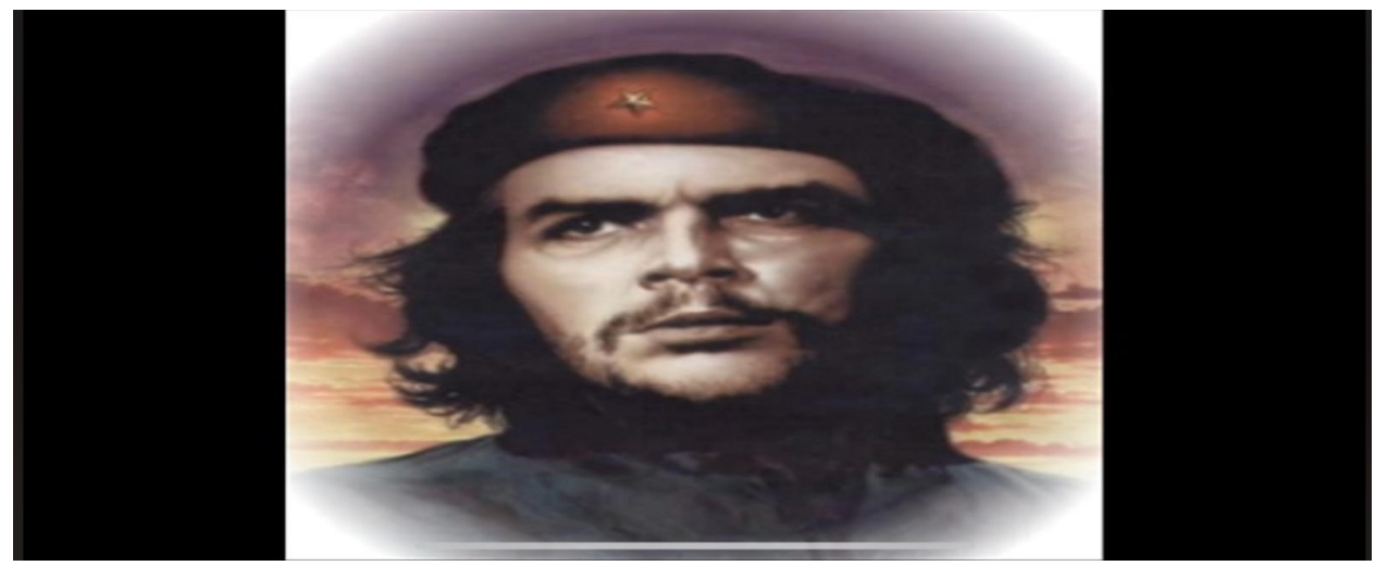
Figure 5.1 A visual image taken from video song Pada pada warna

Step by step, let's come together, It's a battle, it's a battle. Step by step, let's move forward, It's a battle, it's a battle. This is a battle in the name of honor, This is a battle for the sake of right, And this is a battle for the sake of the country (Pada pada warna, 2010)