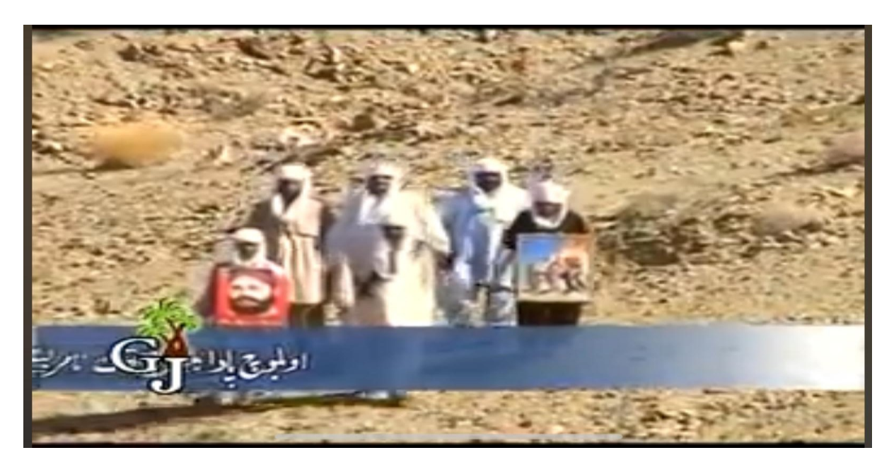
Figure 5.5. A visual image is taken from the song Inglaab

In the video of this song, peaceful way of protest is also shown. For instance, the above picture 5.5 shows that a small group of people is protesting in a non-violent way carrying placards of missing persons. This can be referred as "protest music" (Vandagriff, 2016). The song is more narrative, which can motivate people to protest. There is no bloodshed or any violent scenes shown throughout the video, which allows its viewers to showcase the struggle of the people of Baluchistan. The tone of the music is very calm yet inspiring and appealing.