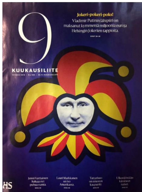
Figure 2. Picture of the cover of HS Kuukausiliite (September 1, 2018).

financiers within Putin's inner circle, and how they had made their money...And I thought that Harry Harkimo's dual role as a member of the Finnish parliament and a partner of Putin's cronies had never been critically examined properly.