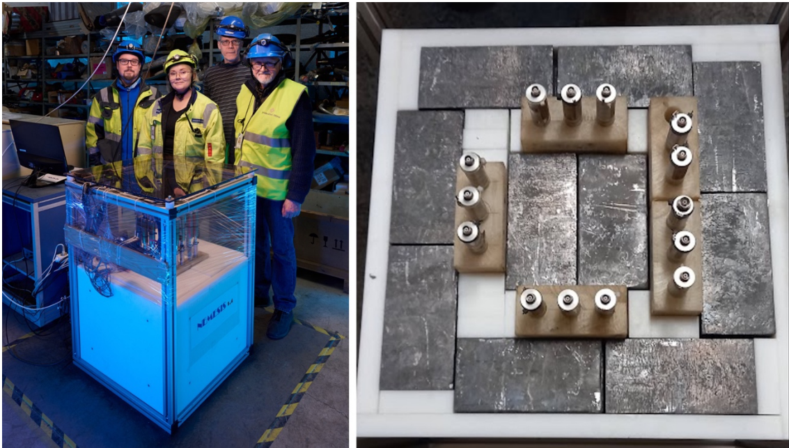
Figure 1. (Left) Photo of the fully assembled NEMESIS 1.4 setup. (Right) Configuration of the target (10 Pb bricks in 10 stacks of 10 bricks each) and fourteen helium-3 counters in PE casting. The picture was taken before adding the electronics, the external PE layer, and protective covers.

Experiments in the Pyhäsalmi mine are the first dedicated attempt at indirect terrestrial DM detection. Our measurements consistently see small but statistically significant excess events in neutron multiplicity spectra from Pb targets. These excess events appear to have peak-like structures, discernible in long-exposure spectra. Such structures cannot originate from muon-induced spallation alone. It is, therefore, possible that the missing contribution comes from WIMP interactions [2].