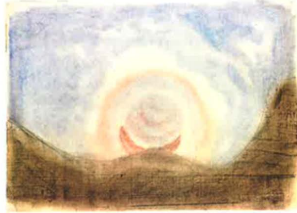
Rudolf Steiner, Nature Mood sketches: Moonrise (1922) and Moonset (1922) (Stebbing 2008, 98).