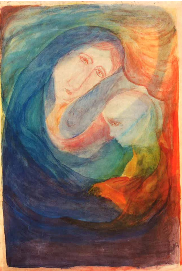
Rudolf Steiner, New Life (Mother and Child) , 1924 (Stebbing 2022, 42).

orders, various cultic practices and a multitude of gods and goddesses whose voices could not be clearly heard and understood. There were initiates in this phase who were waiting and preparing for a sacred birth by assuming that, through divine intervention, the evolution of humanity could receive a new impulse and it could be renewed and enlivened (Lord 2017, 1). The title of Steiner's painting New Life can be associated with incarnation, the word transforming into flesh.