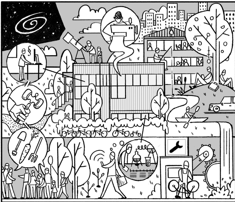
Figure 23.4 Culturally sustainable circular economy.

Mobility is based on sustainable solutions, including cycling and walking, mobility-as-a-service, public transportation, and fossil-fuel-free vehicles. Mobility services are so affordable