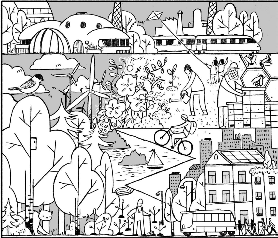
Figure 23.2 Environmentally sustainable circular economy.