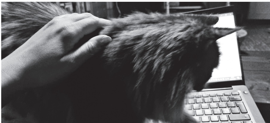
Figure 9.1: Cat-writing in practice.

I leave these poetic fragments here as a budding endeavour to represent the process of thinking- and writing-with my cat companion.