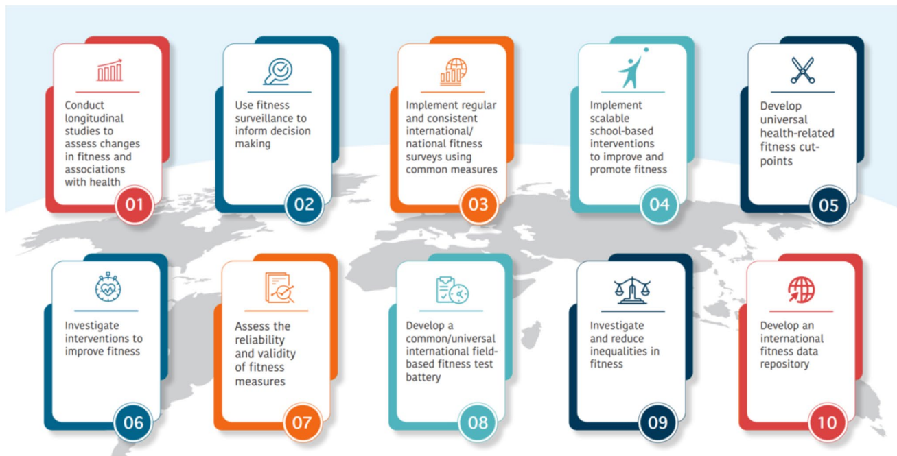
Fig. 2 Top 10 international priorities for physical fitness research and surveillance among children and adolescents identified by international experts in fitness

Australia, have recently scaled back ongoing national fitness surveillance efforts [52]. National fitness surveillance efforts in Slovenia identified a 13% decline in the fitness levels of youth aged 6–15 years following 2 months of COVID-19-related lockdowns [53]. Other countries used national fitness surveillance to identify regions/groups with low fitness levels and in need of intervention [54]. The approach to incorporate national fitness surveillance efforts have also been used to track the effectiveness of national policy efforts aimed at increasing the physical activity levels of children and youth in the school context [55]. Countries could further benefit from leveraging the measurement of physical fitness (CRF and MSF) to inform and track the effectiveness of policy and programming to improve the health of children and adolescents.