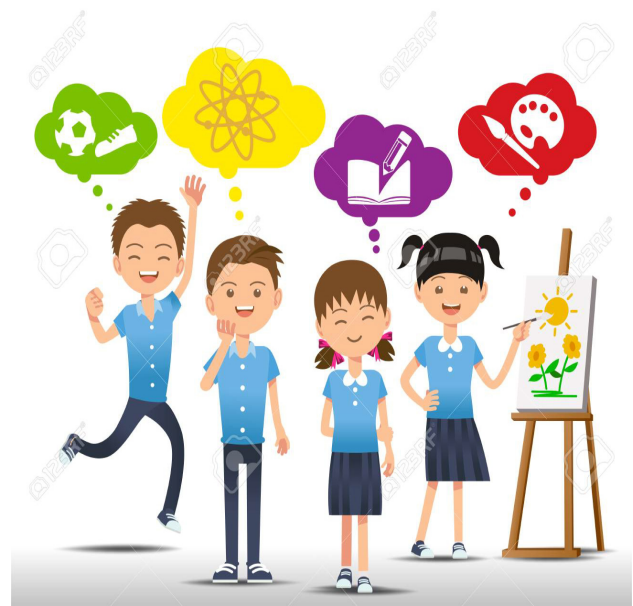
FIGURE 4 A participant's visualisation in which pupils' affinities and topics of interest are showcased.

One example of an implicit reference to differentiation through pupils' individuality was a visualisation