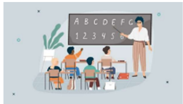
FIGURE 2 A participant's visualisation which depicts the uniform school culture.

The physical learning environment also includes all the artefacts for learning, such as ICT equipment. These were strongly present in the participants' visualisations and many also elaborated on the use of ICT (i.e., computers, tablet, phones) in their verbal comments. One explanation for this could be that ICT plays a very important role in Finnish education and is, among other things, one of the transversal competencies that should transcend all teaching in the national core curriculum for basic education