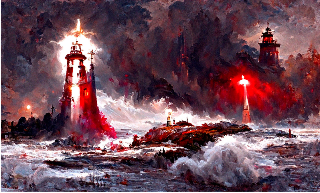
Figure 2. Digital artwork generated with DISCO Diffusion from the input prompt ‘A beautiful painting of a singular lighthouse, shining its light across a tumultuous sea of blood by greg rutkowski and thomas kinkade, Trending on artstation.’ This prompt is part of the default configuration settings in the DISCO Diffusion notebook. 16

Prompt engineering resembles a conversation with the text-to-image system. A practitioner typically will run a prompt, observe the outcome, and adapt the prompt to improve the outcome. Prompt engineering, thus, is iterative and practitioners formulate prompts as probes into the generative models’ latent space. The online community quickly found that the aesthetic qualities and subjective attractiveness of images can be improved by adding certain keywords and key phrases to the textual input prompts. The terms may be referred to by a number of different names, such as ‘style phrases’, ‘clarifying keywords’ (Pavlichenko and Ustalov 2022), or ‘vitamin phrases’ (Pressman and Crowson 2022). In this paper, we refer to them as