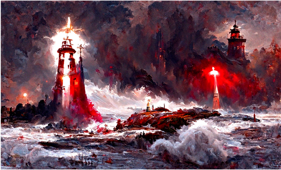
Figure 2. Digital artwork generated with DISCO Diffusion from the input prompt ‘A beautiful painting of a singular lighthouse, shining its light across a tumultuous sea of blood by greg rutkowski and thomas kinkade, Trending on artstation.’ This prompt is part of the default configuration settings in the DISCO Diffusion notebook. 16

Prompt engineering resembles a conversation with the text-to-image system. A practitioner typically will run a prompt, observe the outcome, and adapt the prompt to improve the outcome. Prompt engineering, thus, is iterative and practitioners formulate prompts as probes into the generative models’ latent space. The online community quickly found that the aesthetic qualities and subjective attractiveness of images can be improved by adding certain keywords and key phrases to the textual input prompts. The terms may be referred to by a number of different names, such as ‘style phrases’, ‘clarifying keywords’ (Pavlichenko and Ustalov 2022), or ‘vitamin phrases’ (Pressman and Crowson 2022). In this paper, we refer to them as