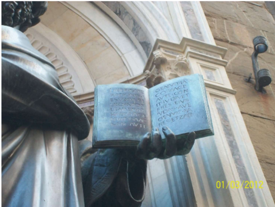
Fig. 1 Ghiberti (1378-1455), St John the Baptist. Florence, Orsanmichele, 1419-1422. Note the absence of shading.

tablets, such as Ghiberti's statue of St John the Baptist outside the church of Orsanmichele, datable to c. 1412-1416 (Fig. 1). 2 Generally, the models of early fifteenth-century Florentine inscriptions are mediaeval, not ancient, as regards the often somewhat irregular spacing, very weak shading and the morphology of the letters, especially the absence of serifs (Fig. 1). Just as the antiqua script developed on the basis of late Carolingian minuscule, the capitals used in monumental contexts were of Carolingian inspiration (Figs 1 and 2). As in humanist texts in general, there was a gradual adoption of ancient dating ( Kalendae, Nonae, Idus ), ancient formulae and terminology ( papa > pontifex maximus etc.) (Figs 2 and 3, still with papa ).