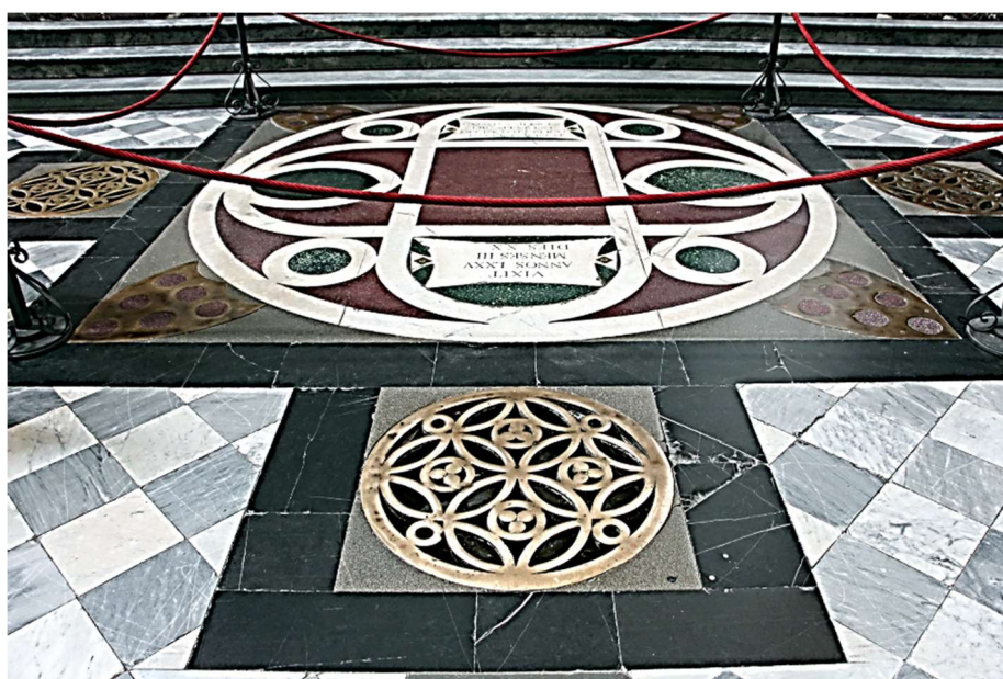
Fig. 12 The upper part of the tomb, with the inscription, presented as a tabula ansata , datable to after 1530 in regular sixteenth-century capitals.

The upper, sixteenth-century inscriptions are again eminently classicising in form, COSMVS MEDICES // HIC SITVS EST // DECRETO PVBLICO // PATER PATRIAE (Cosimo de' Medici lies here, by public decree, father of his country) and VIXIT // ANNOS LXXV // MENSES III // DIES XX (he lived for 75 years, 3 months, 20 days). Decreto publico might refer either to the classical burial formula hic situs est , reminiscent of Pompey's tomb, among others, or to pater patriae , a hallowed Roman title accorded to such heroes as Camillus and Cicero, and which the state bestowed upon the late Cosimo in 1465. 32 It is no wonder that the title should have been eliminated after the first overthrow of the Medici. 33