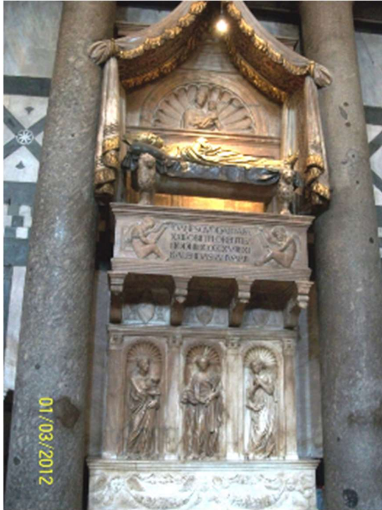
Fig. 2 Donatello (c. 1386-1466) and Michelozzo (1396-1472), Epitaph to anti-pope John XXIII (1425-27) Florence, Baptistery.