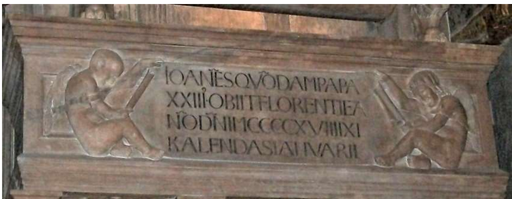
Fig. 3 Epitaph to anti-pope John XXIII. Florence, Baptistery. Note the absence of serifs and the use of Roman dating combined with mediaeval formulae: A(n)no D(omi)ni MCCCCXVIII XI Kalendas Ianuarii (In the year of the Lord 1418, on 22 December).