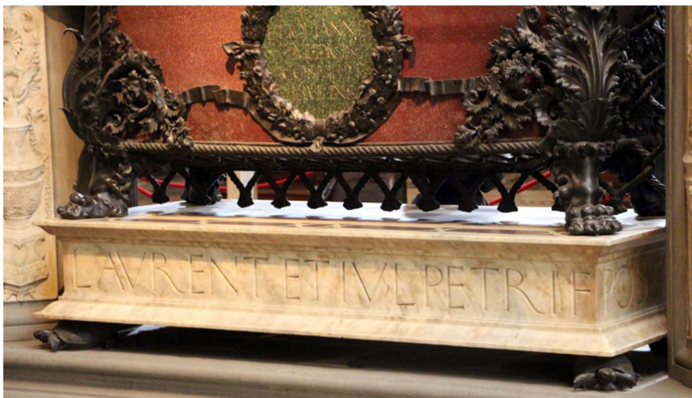
Fig. 14 Detail of the tomb in the Cappella delle reliquie .

The formula-wise eminently classicising upper inscription on the side towards the Cappella delle reliquie is placed in a round shield of serpentine marble with an oak wreath in bronze. The spacing is again relatively regular, and the lettering presents traditional capitals with attempt at shading and devoid of serifs: PETRO // ET IOHANNI DE // MEDICIS // COSMI P(atris) P(atriae) F(iliis) // H(oc) M(onumentum) H(aeredem) N(on) S(equetur) (To Piero and Giovanni de' Medici, sons of Cosimo father of his country. This monument will not go to the heir). 36 The inscription running round the white marble base is palaeographically somewhat nearer to the new, Northern style, in classicising capitals with an attempt at shading but still without serifs: (1) LAVRENT(ius) ET IVL(ianus) PETRI F(ili) (2) POSVER(unt) (3) PATRI PATRVO QVE (4) MCCCCLXXII [Lorenzo and Giuliano sons of Piero erected (this monument) to their father and uncle in 1472].