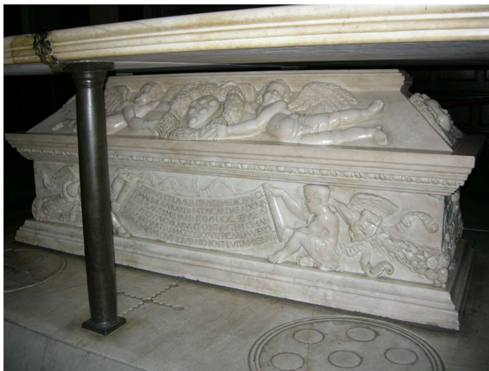
Fig. 6 The sarcophagus of Giovanni di Bicci and Piccarda di Edoardo. Inscription in prose on a parchment roll held by putti. Photo Sailko, GNU Free Documentation License

The sarcophagus presents two inscriptions, the one in prose providing biographical data on the committents and the deceased, and another in elegiac couplets with the funeral poem proper. Both the prose inscription, 13 on a parchment roll held by putti, just as in the epitaph to John XXIII (Figs 2 and 3), and the one in elegiacs, 14 inscribed on a Classicising tabula ansata also held by putti, 15 present the same kind of capitals without serifs but an attempt at shading by thickening of strokes (Fig. 1). The oblique strokes of M do not