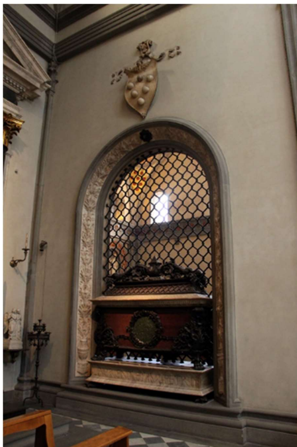
Fig. 13 Piero and Giovanni di Cosimo's tomb.

The monument to Cosimo the Elder's sons, Piero and Giovanni, was also designed by Andrea del Verrocchio 1469-1473 and placed in the wall between the Cappella delle reliquie (or the chapel of Saints Cosmas and Damian) and the Sagrestia Vecchia , and consequently highly visible. 34 Again, typically for Andrea, the monument is multi-coloured with porphyry, white and green serpentine marble as well as elements in bronze. 35 There are inscriptions on both sides. Palaeographically, the monument harks back to the Florentine tradition, although with some elements possibly pointing to awareness of the new, Northern style.