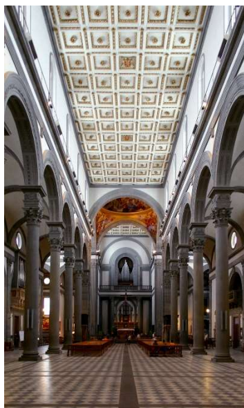
Fig. 10 The central nave of S. Lorenzo.

Cosimo's monument was built in front of the high altar of S. Lorenzo, with a multi-coloured (imperial porphyry, white marble, green serpentine and bronze) arrangement featuring two inscriptions placed in classicising tabulae ansatae , on the one hand, and in the crypt below, on the other, where a sarcophagus with an inscription seems to carry out the same function of sustaining the church as Cosimo's parents' monument and actual burial place did. 27 Cosimo had furthermore secured exclusive burial rights in the central nave, thus maximising the visibility of the upper part of his monument. 28 Upon the Republican revolution of 9 November 1494, when the Medici were exiled from Florence, part of the upper inscription ( decreto publico // pater patriae , by public decree, father of his country), suffered a damnatio memoriae , only to be restored on the return of the Medici in 1512, again eliminated in 1528 and restored after their definitive return in 1530. 29