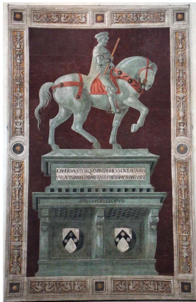
Fig. 4 Paolo Uccello, John Hawkwood. Fresco. Duomo, Florence. Photo Sailko. CC BY 3.0. Public domain

The monumental use of inscriptions in capitals all'antica strongly develops from the beginning of the 1430s onwards, on stone, metal and in frescoes. Both Michelozzo (inscriptions) and Paolo Uccello (1397-1475), whose 1436 fresco representing an equestrian statue of the condottiero John Hawkwood aka Giovanni Acuto (c. 1323-1394) in the Duomo of Florence sports an inscription in relatively regular, serified monumental capitals (Fig. 4), contribute to this development.