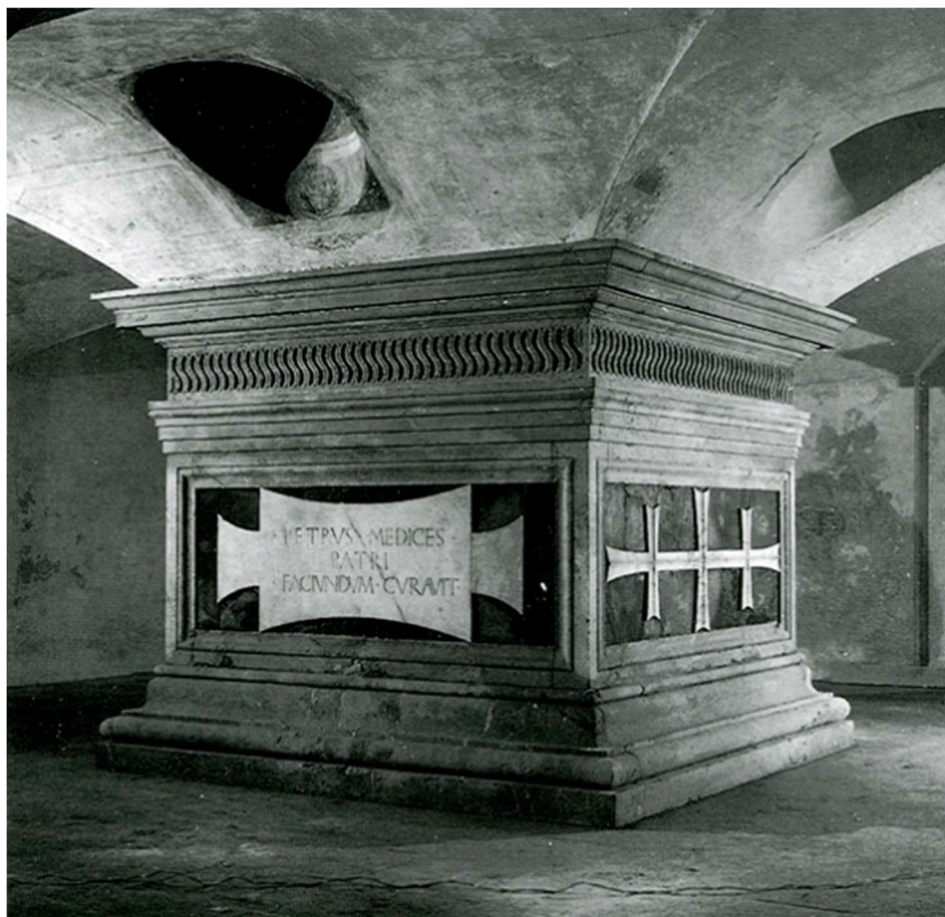
Fig. 11 The subterranean part of Cosimo the Elder's tomb.

The lower part of the monument, supporting the central nave floor, is a sarcophagus with an inscription on a tabula ansata : PETRVS MEDICES // PATRI // FACIENDVM CVRAVIT (Pietro de' Medici had [this monument] made for his father). 30 The spacing is relatively regular and the lettering consists of regular capitals with an attempt at shading through thicker lines but without serifs. 31 As in Giovanni di Bicci's and Piccarda di Edoardo's inscriptions, there is a high M (l. 1), but also, more classically, an M with the central strokes touching the base line (l. 3). Consequently, and expectedly,