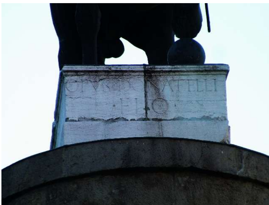
Fig. 8 Donatello, monument to Gattamelata. Padua, Piazza del Santo (post 1447-ante 1453).

pedestal of his statue of Gattamelata in Piazza del Santo of Padua, OPVS DONATELLI .FLO(RENTINI) (Work of Donatello the Florentine), datable to 1447-1453, exhibits fully-fledged Augustan-type capitals geometrically designed and complete with shading, a significant departure from the lettering previously used in monuments designed by him. 19