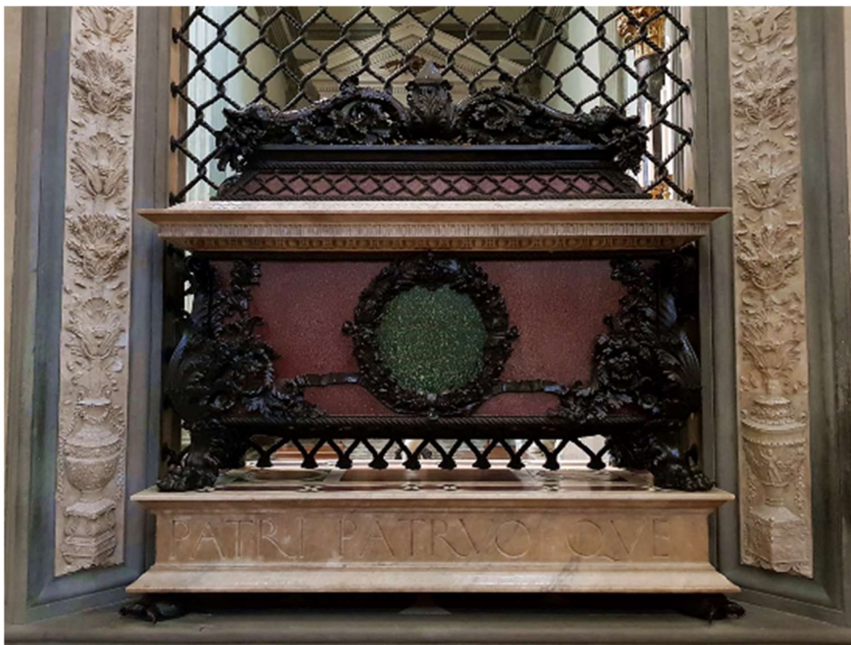
Fig. 15 The tomb from the Sagrestia vecchia side.

The upper, formula-wise classicising inscription is again placed in a round shield in serpentine marble with an oak wreath in bronze: PET(rus) VIX(it) // AN(nos) LIII M(enses) V D(ies) XV // IOHAN(nes) // AN(nos) XLII M(enses) IIII // D(ies) XXVIII (Piero lived for 53 years, 5 months, 15 days, Giovanni 42 years, 4 months, 28 days). The spacing is relatively regular, and the lettering consists of traditional capitals with attempt at shading, again without serifs. For the base, see above, (3) and (4).