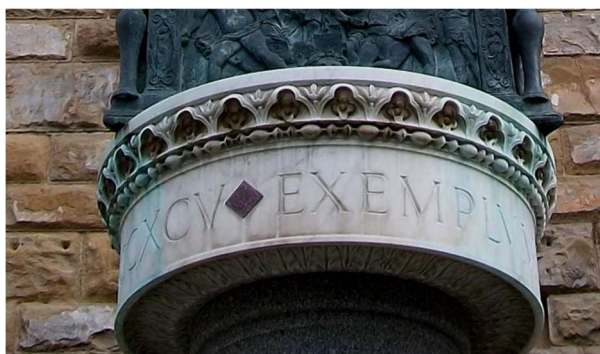
Fig. 17 Donatello, Judith and Holophernes, 1455-1457/1460? Inscription from 1495. Florence, Palazzo Vecchio.