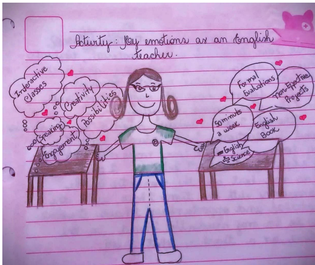
Figure 3. Visual Narrative 3

Another expectation clearly expressed in both datasets was that of a teacher who makes learning fun and interesting. Aparecida's (Br) picture illustrates this by including two poles of teaching in her picture.