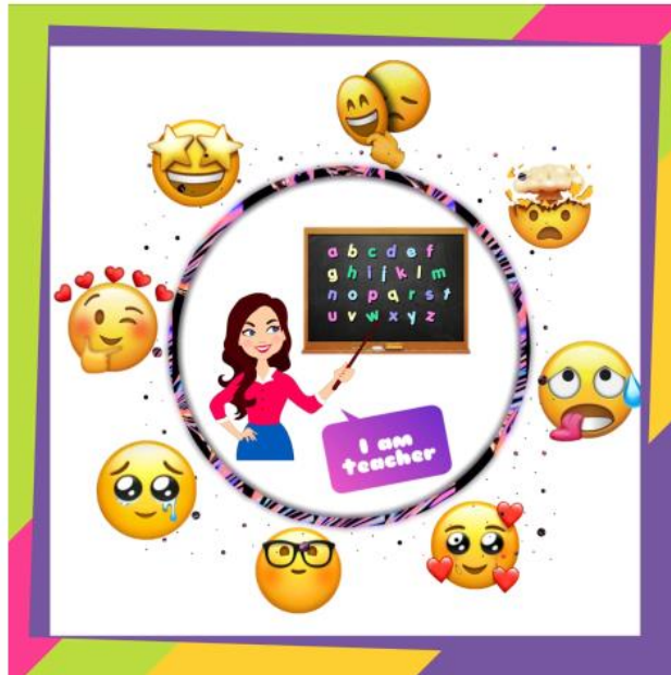
Figure 4. Visual Narrative 4