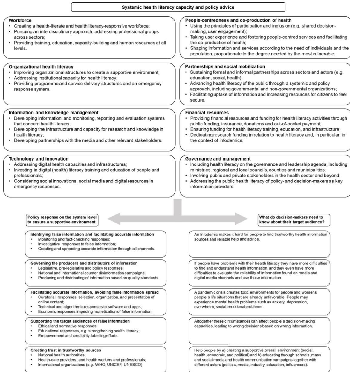
Fig. 3. Health literacy responsiveness of the policy sector to manage the infodemic (model informed by the UNESCO framework and the Pan American Health Organization fact sheet no. 5 on the infodemic) [3,9,72].

collaborative surveillance, (2) community protection, (3) safe and scalable care, (4) access to counter-measures, and (5) emergency coordination. Strengthening HERP systems and implementation also will support developing and delivering measures to promote population health literacy [71].