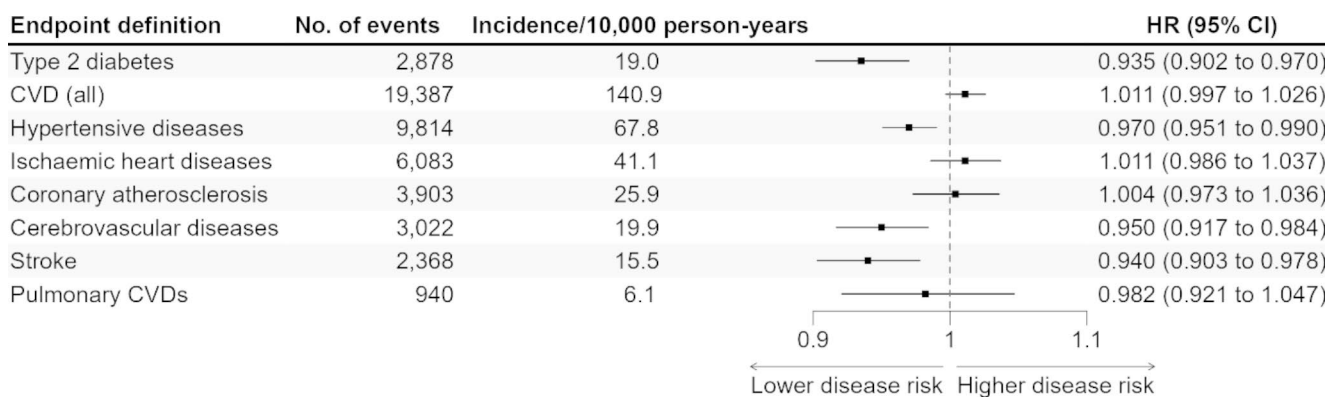
Fig. 3 Associations between the polygenic risk score for physical activity (PA PRS) and cardiometabolic diseases using Cox proportional hazard models among 24,960 participants free of cardiometabolic diseases at baseline. Hazard ratios ( HRs ) alongside with their

respective confidence intervals ( CI s) per each standard deviation of PA PRS for overall cardiovascular diseases and specific outcomes identified in the hospital register are graphically and numerically illustrated. CVD=cardiovascular disease for men ( HR=0.913 , 95\% CI=0.833, 1.001 ) or women ( HR=1.049 , 95\% CI=0.961, 1.146 ). Sex-specific analyses can be viewed in the Supplementary material (Supplementary Tables S7 and S8). Sensitivity analyses were conducted to see whether changing the follow-up starting year from birth year to the year 2008, the year of data collection in HUNT3, to see if these adjustments would change results substantially. The HRs of Model 1 (Supplementary material; Supplementary Table S9) of the sensitivity analyses of cerebrovascular diseases, hypertensive diseases and stroke remained statistically significant but were slightly lower compared to the HRs from the main analyses (Fig. 3). Also, type 2 diabetes was no longer statistically significant in the sensitivity analyses. However, the effect sizes of the statistically significant HRs remained low in the sensitivity analyses when expressed as Cohen's d effect size estimates.