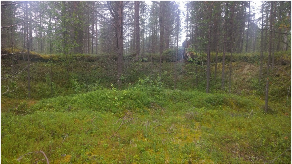
Images 4 and 5: Trench and information signs with QR codes at the Outdoor Museum of Siida. Photos by Eerika Koskinen-Koivisto, 2015.

In theorizing the politics of commemoration, Jay Winter has divided the silences around war into three categories: (1) Liturgic silence motivated by loss and grief; (2) strategic and political silence that aims at balancing the contradictory ideologies and views of the past, and (3) essentializing silence that indicates who