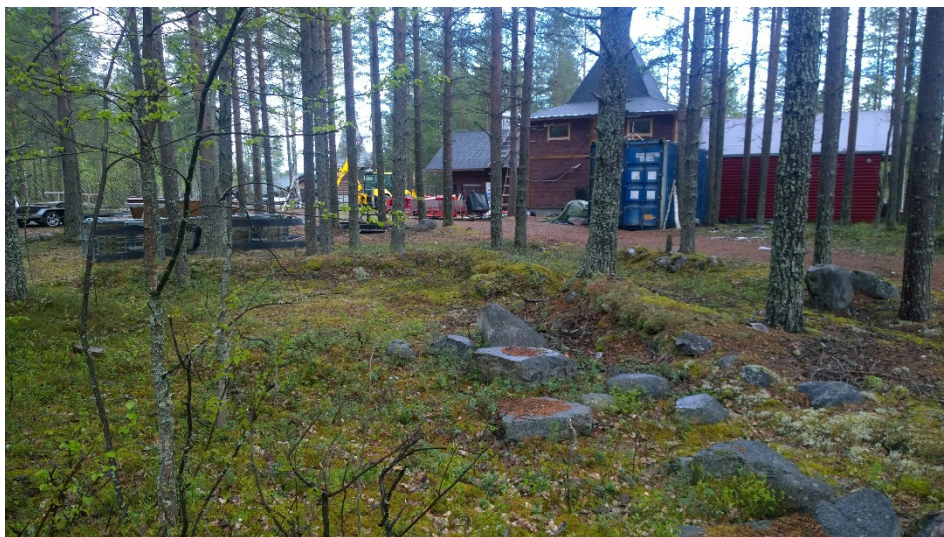
Image 2: WWII remains near Santa Claus Village, Rovaniemi. Photo by Eerika Koskinen-Koivisto, 2015.

During our fieldwork in Lapland, we discovered sites that have been deliberately avoided and thus collectively forgotten. These kinds of places have been seen as sites of forgetting or oblivion ( lieux d'oubli ) that are avoided because of “the disturbing affect that their invocation is still capable of arousing”. 25 Some of these sites are located in the plain wilderness far away from human settlements, but interestingly enough, there are also those located right next to tourist attractions. One of them is Santa’s Village, the most popular tourist attraction of Rovaniemi, built right on the site of a former German Military base. 26 This information is not indicated anywhere in the area and the former military history of the area is not used in any way in the tourism business. WWII history is clearly problematic when it comes to international tourism, and this is understandable.