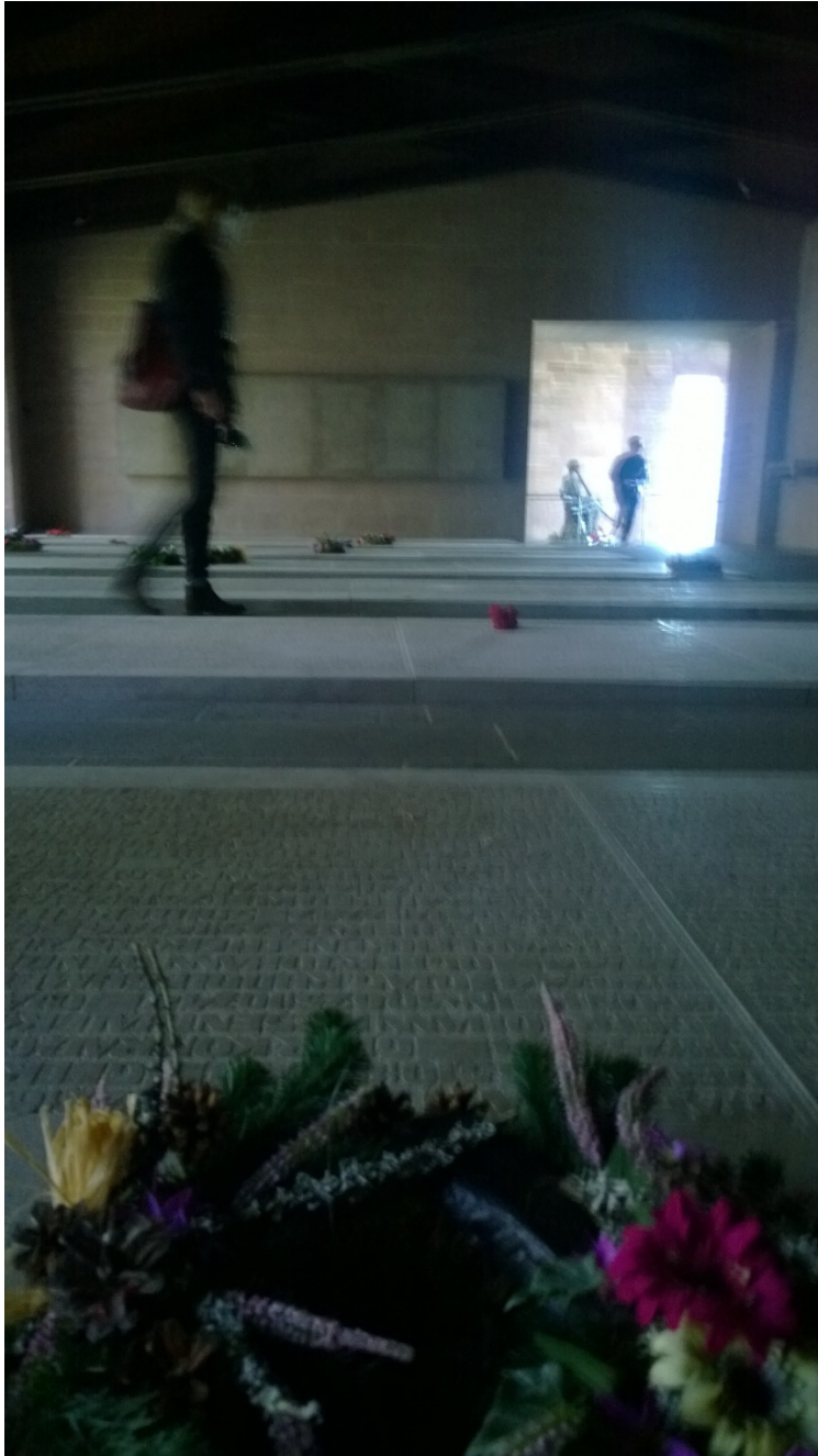
Images 6 and 7. The Mausoleum of the Norvajärvi German Cemetery. Photo 6 by Suzie Thomas, photo 7 by Eerika Koskinen-Koivisto, 2015.