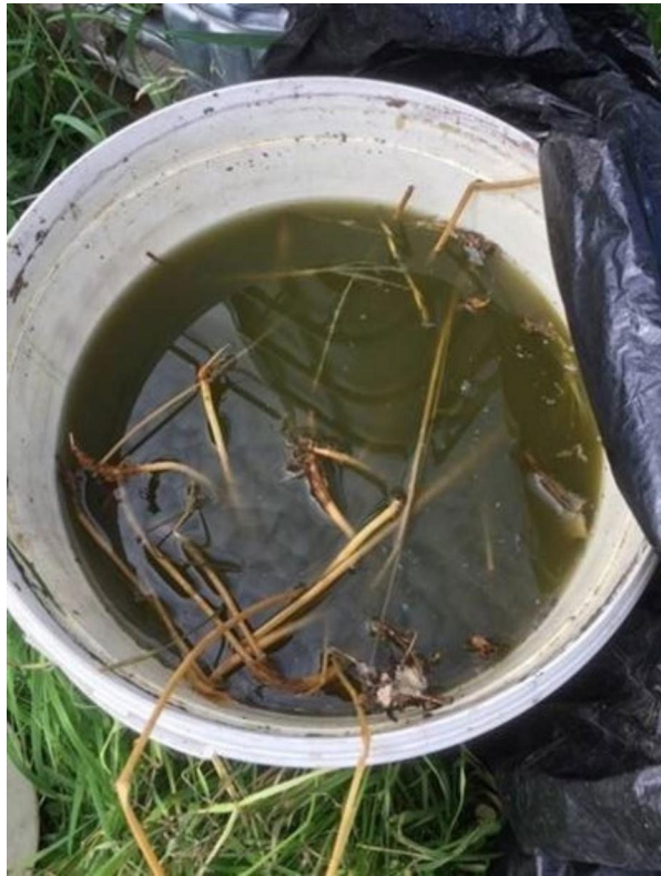
Fig. 3 Weed tea fertilizer made using Grandmother's recipe.

able effects, such as extensive weed growth: “ We always got problems, because we didn't do enough work during the growing season so weeds could take over the field ” (Viktor).