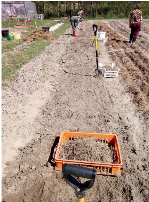
Fig. 2 Members tilling the soil, pulling up couch grass, and spreading hemp mulch over the onions in 2020.