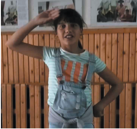
Fig. 6: Pupil contextualising the image through dance performance, first dance movement.