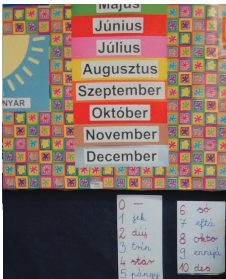
Fig. 1: Numbers in Romani displayed in a classroom.

Translanguaging was introduced to teachers with the help of Translanguaging Workshops in which teachers had the opportunity to discuss challenges and difficulties in teaching with a translanguaging stance. Getting familiar with the concept of translanguaging and its implications, teachers started involving Romani in their teaching which in turn had an impact on the schoolscape. For example, when translanguaging started to be involved in Maths lessons, it was an easy and successful task for both teachers and pupils to learn the numbers and number rhymes in Hungarian and in Romani. In line with this, the semiotic space was being transformed in the classroom: the teacher displayed the numbers in Romani in the classroom walls; the display also became her aid to check the pupils' answers so that they could more easily assess their performance (Fig. 1). This way, these Maths signs also scaffolded the teachers' learning of Romani. As part of the semiotic practices of the teacher and the pupils, the linguistic landscape of the classroom had started to change simultaneously by the formation of the translanguaging space. This was one of the very first translanguaging displays in the school.