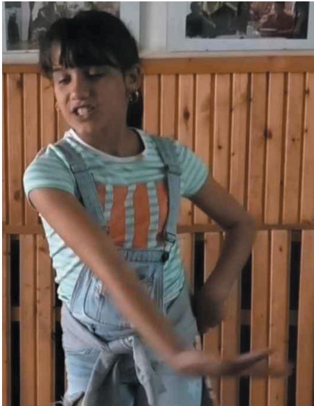
Fig. 7: Pupil contextualising the image through dance performance, second dance movement.

used to counting in Romani as well. In the context of the schoolscape-related task, pupils chose the sign of numerals as a significant item and read the numerals from one to ten. Once the reading was completed, they continued counting by enlisting the numerals above ten. Although the numerals in Romani were displayed only from one to ten, in the pupils' understanding, it is possible to count in Romani from ten onwards as well. By doing so, the pupils demonstrated that the language items featured on the wall are parts of a larger and complex system.