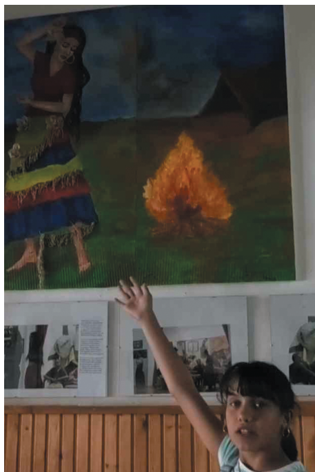
Fig. 5: Pupil verbally interpreting the image.

This cultural aspect is enriching to representatives of other groups as well: to the young girl, this picture comes to life, and people not belonging to Roma communities can't see that dance until then she performs it. That is, group-external people might not access some cultural references that are taken for granted for members of another group, but visual representations as well as related performances make such references accessible, at least partially, to all. In this case, interaction with and about a schoolscape item triggered a short dance performance, that is, an element of Roma dance culture got embodied in the translanguaging space of the school.