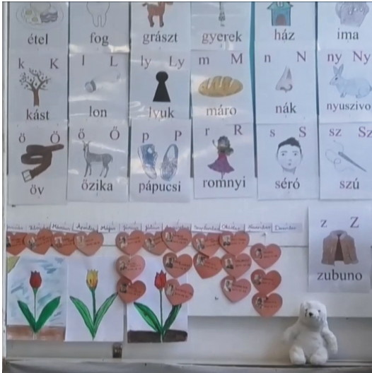
Fig. 2: The “Romani alphabet” displayed on the wall (27: 1.42–1.45).

makes the development of literacy skills easier since the pupils do not need to learn two separate orthographic conventions in parallel. Further, this principally phonemic orthography makes it possible to represent the dialectal characteristics of pupils' speech (for further details, cf. Chapter 13). For example, pupils are free to write down the words according to how they speak and how they hear others speaking.