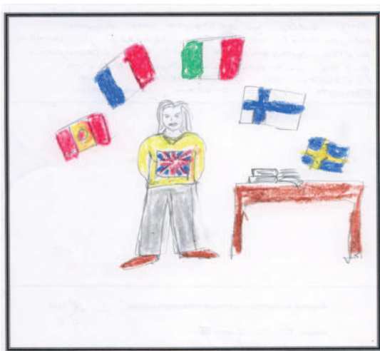
FIGURE 1. Self-portrait of a learner of English: with books.

Figure 1 illustrates some of the findings of this study.