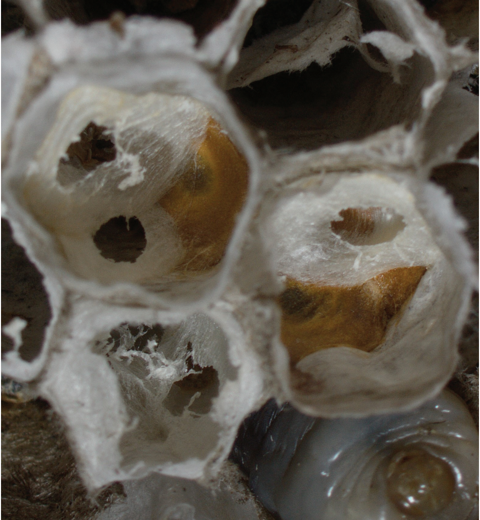
Figure 1. White Sphecophaga vesparum cocoons from which the parasitoid has emerged, and closed yellow cocoons in a nest of Dolichovespula media . A host cell may have both white and yellow cocoons.

females and possibly males; and 3) resistant yellow, overwintering cocoons (Donovan 1991). I classified the cocoons as white or yellow because I was not confident in separating the two types of yellow cocoons, except in one nest. Aphomia sociella larvae were counted or the past presence of the species was determined by the silk spun by the larvae.