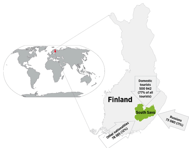
Fig. 2. Research site: the South Savo region in Finland and the number of tourists in 2018 (The Regional Council of South Savo, 2018).

Quantitative data analyses were conducted using the statistical analysis software SPSS 27. Pearson's chi-square tests were used to determine the differences between the Finnish and Russian tourists by focusing on the physical and social servicescape factors and the environmental, social, cultural and economic sustainability dimensions. In the following section, we present the cross-tabulations of the frequencies and percentage values of the Finnish and Russian tourists' sustainability perceptions as well as the results from the Pearson's chi-square tests.