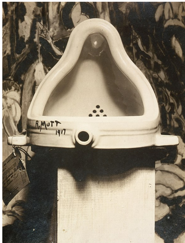
Figure 1: Photograph of Marcel Duchamp's Fountain (1917) by Alfred Stieglitz. Click image to enlarge.

Play relates to how Gadamer explains the ontological structure of artworks, which have a central place in his hermeneutic ontology. Play is "the mode of being of the work of art itself" (Gadamer, 2004, p. 102). Works of art exist as physical objects, but require our participation to exist as art. This does not mean that statues stop physically existing when they are out-of-sight, but that their existence as works of art requires someone to see and appreciate them. They must be interpreted in some historical circumstances and those circumstances determine how art is viewed, appreciated and understood. For example, objects created originally for religious purposes are now often exhibited as objects of art.