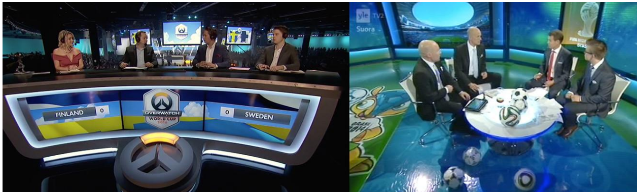
Figure 1. The World Cup studios: on the left, the Overwatch World Cup 2016 broadcast bronze medal match Sweden–Finland, and on the right, the 2014 FIFA World Cup final match broadcast Germany–Argentina (Yle TV2, Finland).

form of hegemonic masculinity born from a combination of traditional masculinity, athletic masculinity, technological expertise, and gaming performance (Lockhart, 2015; Taylor, 2012; Voorhees, 2015; Witkowski, 2012a).