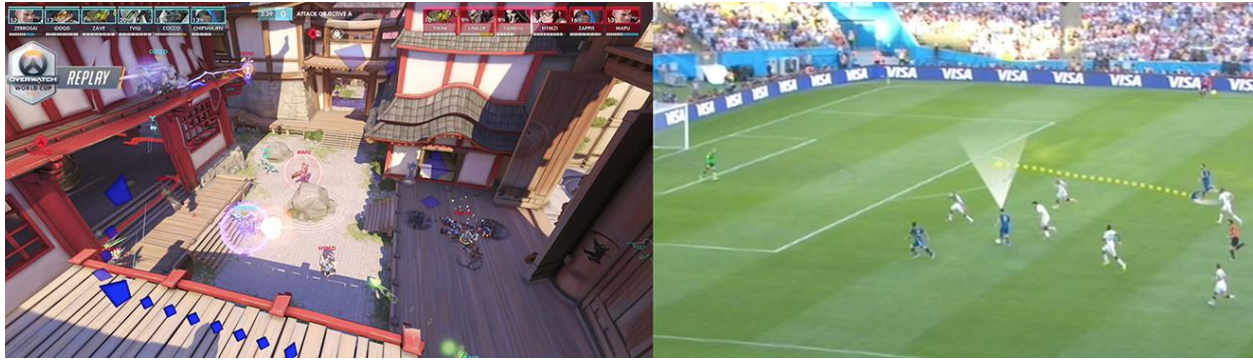
Figure 2. Game analysis: on the left, the Overwatch World Cup 2016 broadcast bronze medal match Sweden–Finland, and on the right, the 2014 FIFA World Cup final match broadcast Germany–Argentina (Yle TV2, Finland). Notice the similar use of arrows in both presentations.

In the Overwatch broadcast, two types of statistics are shown between individual games: “Hero Use Stats,” presenting all the relevant numbers (damage done, kills achieved, number of deaths, etc.) from one hero played by one player in the previous game, and “Head to Head” (team vs. team) numbers from the previous game. As these statistics are shown on the screen, the casters usually comment them. This is a common way to share information in televised sports in general (Figure 3). In traditional team sports, in addition to head-to-head-like statistics, all-time records and high scores (between different players and league teams or national teams) are usually mentioned in the broadcasts. At least so far, there seems to be a lack of these kind of general statistics in eSports—probably at least partly related to the constant patching, which induces changes in the games, greatly affecting the power of individual characters and team compositions and making it difficult if not impossible to compare individual player performances between various patches. In the FIFA broadcast, statistics also show other interesting details not directly related to game points—for example, that the German midfielder Bastian Schweinsteiger runs almost 14 km during the match.