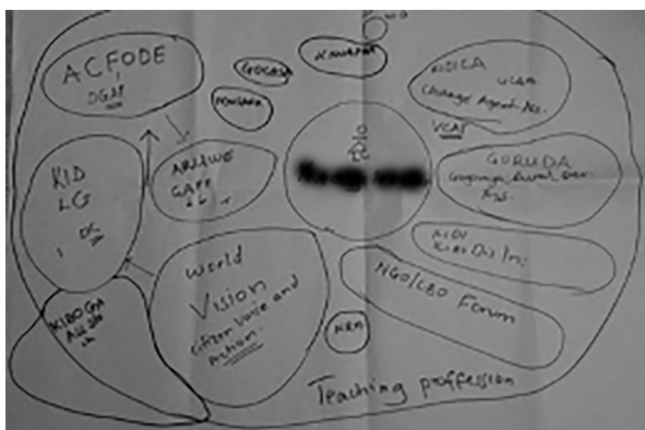
Figure 1. Example of the Venn diagram Note. Field photo of the Venn diagram of a female teacher and councillor in Kiboga.

When drawing her Venn diagram, the participant positioned herself in the centre, then visualized the groups of which she was a member, with the closest and biggest groups those to which she felt most attached. The further or smaller the groups, the less attachment she felt. This promoted the participants' recognition of the importance of, and the sense of identity and belonging to the spaces of participation they acknowledged. Drawing and explaining the Venn diagrams during the interviews gave them an opportunity to reflect on the groups of which they were members, the role they played in their communities, and for some, it allowed critique of their daily activities and roles. Figure 1 presents the Venn diagram of one research participant.