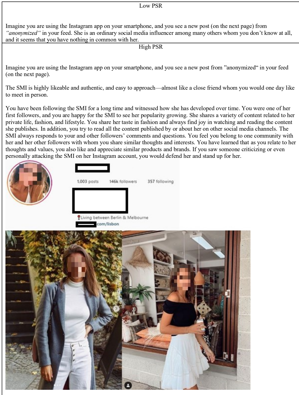
Table 3. The anonymized stimulus for manipulating low and high parasocial relationships.