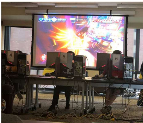
9 Figure 1. Overwatch game play was done in teams of six players in the same large room with 10 audiences watching on the competition screens.