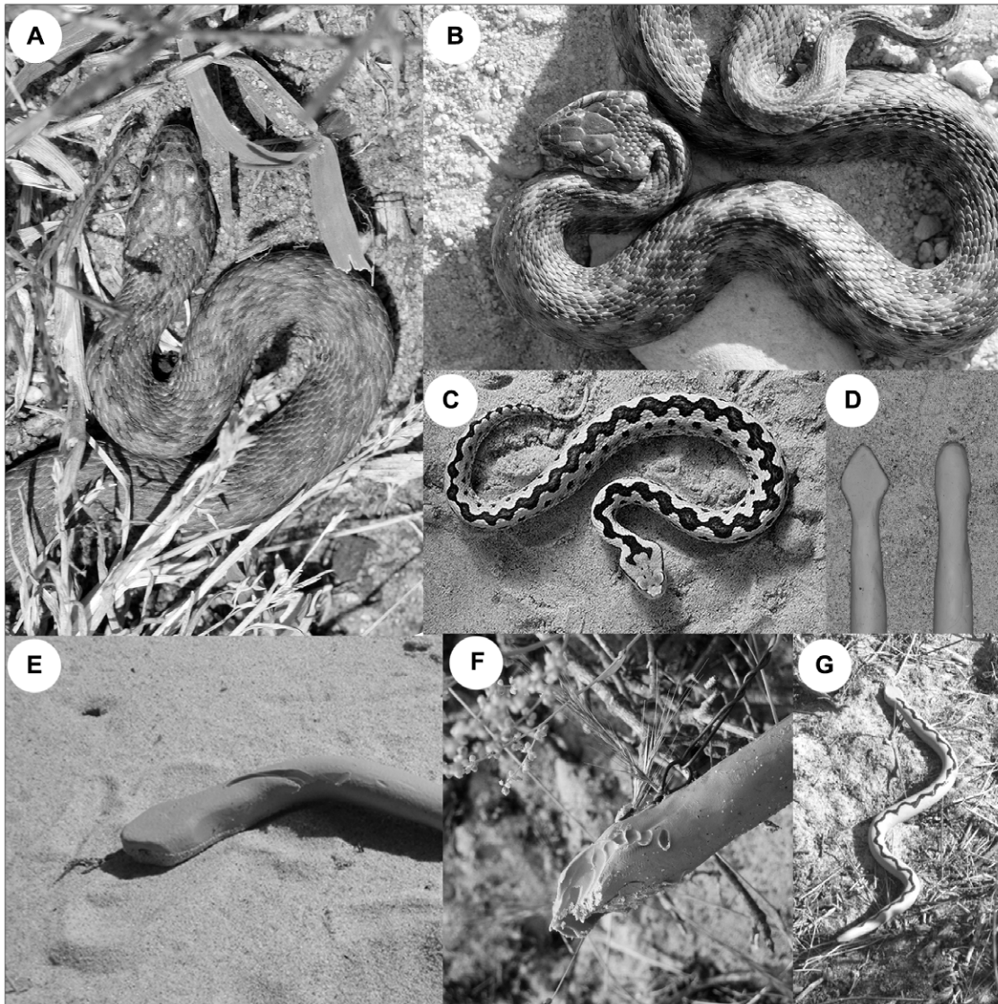
Figure 1. Head shapes of viper and viperine snakes. Natrix maura has a narrow colubrid-like head shape (a). When disturbed, they flatten their heads making the head more triangular in shape (b). Vipera latastei gaditana exhibit the typical triangular head shape of European vipers (c). Triangular, viper-like and narrow, colubrid-like head shapes of plasticine models (d). Attacks of raptors (e) and mammals (f) can be separated from imprints left during predation events. A dorsal zigzag pattern was painted on half of the snake replicas (g). doi:10.1371/journal.pone.0022272.g001