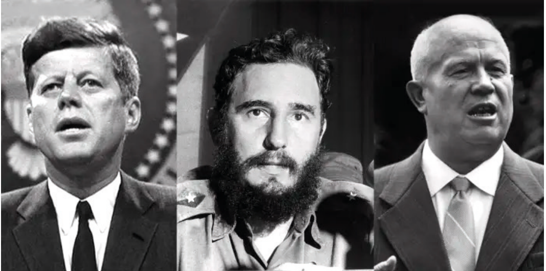
The three main characters of The Cuban Missile Crisis in 1962 were John F. Kennedy, Fidel Castro and Nikita Khrushchev.